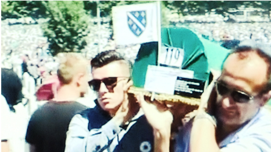
Fig. 4. Still from the documentary-poetry film Bridges <Bosnia 20> .