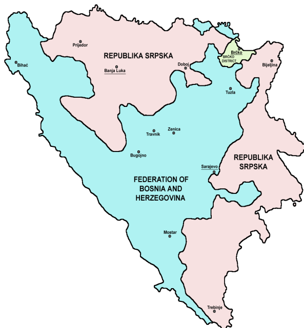
Fig. 2. Map of the inter-entity border.

As such, there remains twenty years after the end of the war in Bosnia, a lack, a loss of a national imaginary beyond the lines drawn across the country by the Dayton Agreement, which was designed to be replaced (Gordy 2015). Indeed the idea of creating a prosperous post-conflict period was not factored into the discussions that took place in Dayton, Ohio; rather ending the war in Bosnia was the sole goal of the accords. Today each entity remains a state in-itself, as each entity of Bosnia-Herzegovina has its own government, flag, coat of arms, police force, customs, postal service, president and parliament or assembly. While a 2-km zone of separation runs on either side of the inter-entity border, making a 4-km zone in total stretching into both entities (Fig. 2). The border is not determined by geographical features, or an existing regional imaginary, rather it traces the front lines during the war