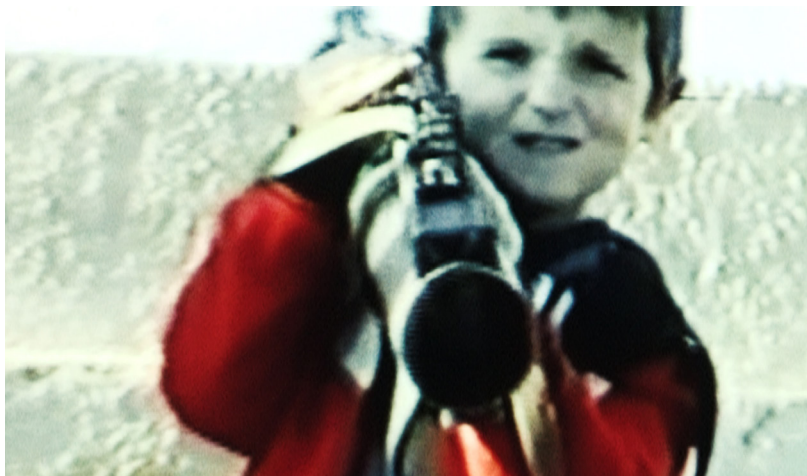
Fig. 1. Still from the documentary-poetry film Bridges <Bosnia 20> .

“poetry bears, powerful and politically productive witness to what the dominant politics in a society after genocide wants to foreclose” (Arsenijević 2011, 168). And we aim here, through the suturing together of poetry and traumatic images, to speak for those whom violence has deprived expression, historically reduced to silence; those citizens deprived of their human face (Felman 2002).