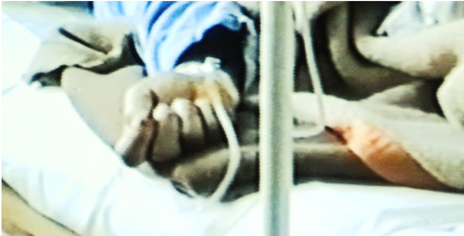
Fig. 5. Still from the documentary-poetry film Bridges <Bosnia 20> .

omit nothing of what is captured in the original films, even when facing something that seems empty of informative value, and there is seemingly nothing to see or nothing happens. Symmetrically they demand us to widen our point of view, to restore the anthropological value of the films, as films which reveal within themselves “a dilution of a special truth”, a giving up of stories, or more precisely, testimony (Caruth 1995: vii).