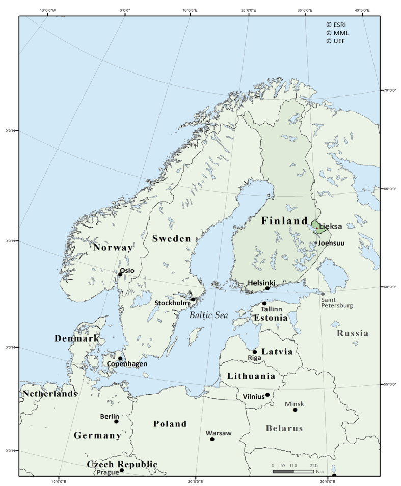
Fig. 1. Lieksa as a distant periphery from the regional centre Joensuu (ca. 100 km) and capital city Helsinki (ca. 500 km).

The excerpts appear in the same form as the transcribed interview data. The interviewees are anonymised using codes from I1 to I8.