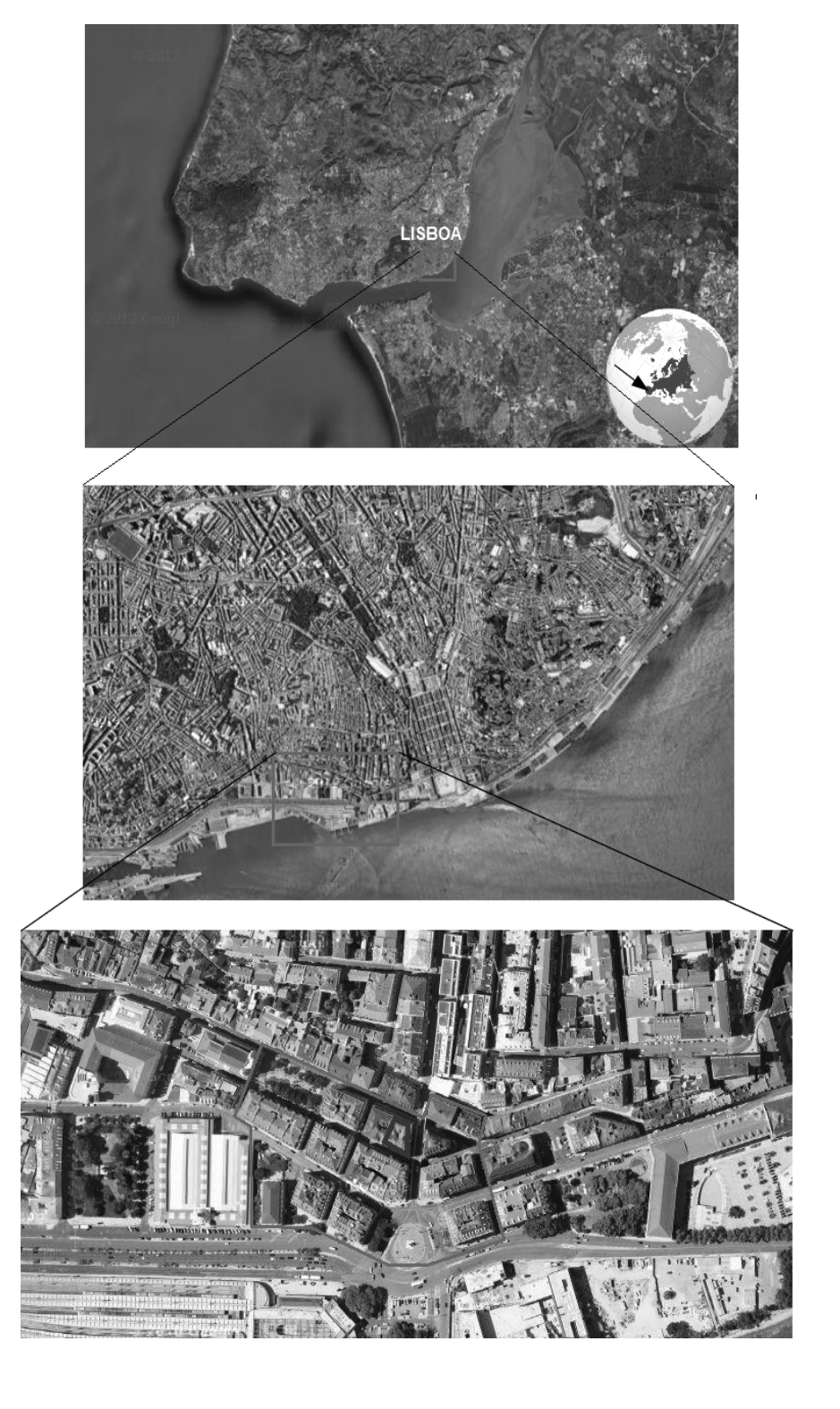
Fig. 1. Localization of Cais do Sodré (Lisbon downtown).