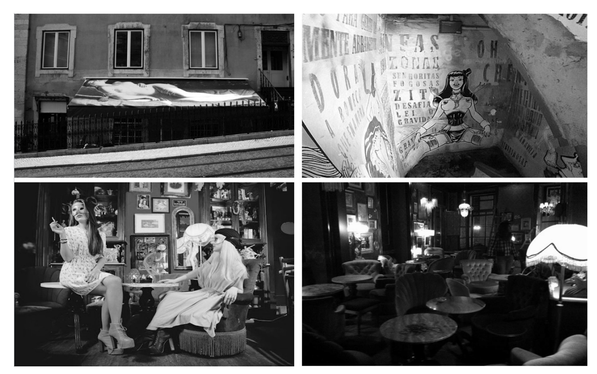
Fig. 5. Inside Pensão Amor: a detail of the first floor (top), and a performance by the Pensão Amor's clientele who are quietly talking (3).

On the rest of the floors, rooms have been renovated to host creative artistic initiatives, including the management office of the Queer Lisbon Festival (Jerónimo 2011). Besides, there is a cabaretstyled room decorated with antique chairs, where clientele can read, talk, and drink distinguishably (see Fig. 5) in a socially sanitized space. (White) bouncers carry out the sanitation of the venue by applying discriminatory criteria based on ethnicity, class, and body appearance. In other words, blacks who migrated from the former Portuguese colonies, gypsies, and anyone who does not appear to belong to the native born middle-upper classes is prohibited from entering the Pensão Amor Hostel.3 The social sanitization carried out by the Pensão Amor's bouncers has strong implications for policing Cais do Sodré's nightlife as well as for how security in public spaces is being privatized; in other words, the way privatization and sanitation in public spaces are today gaining importance is an implication of that ecology of fear featured in the nightlife of most of the Western cities (Chatterton & Hollands 2003).