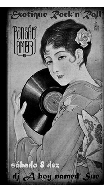
Fig. 6. Some vintage-style flyers of Pensão Amor.

ready confirms the future success of Pensão" (Trindade 2011). In that sense, Pensão Amor offers a socially sanitized menu of night-time elegance, predictable pleasure, and controlled fantasy for its clientele (Fig. 6).