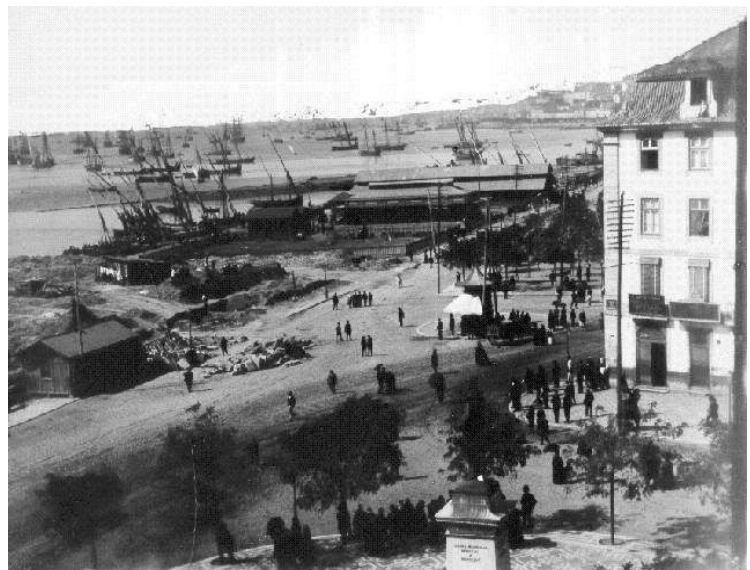
Fig. 2. A sight of the Lisbon waterfront in 1903 (top), and a partial sight of Cais do Sodré in 1900 (bottom). Source: SkyScraperCity 2013.<sup>2</sup>

fascist regime (1933–1974). However, in the 1990s this bohemian nightlife in Cais do Sodré was rapidly replaced by a new one, which was much more oriented to global mass tourism. Till two years ago, tourists, young local people, and Erasmus students had been consuming an urban nightscape in which drugs, marginal prostitution, police, and some few high purchasing power customers had coexisted.