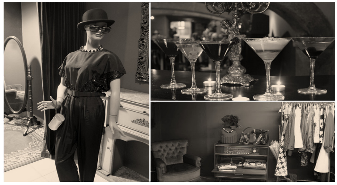
Fig. 3. Vintage design and consumption of distinction in the "Ás de Espadas" store, Lisbon.

At the beginning of the twentieth century, the Cais do Sodré neighbourhood was characterized by a sordid atmosphere. Today, such sordidness has been re-signified into a vintage atmosphere associ-