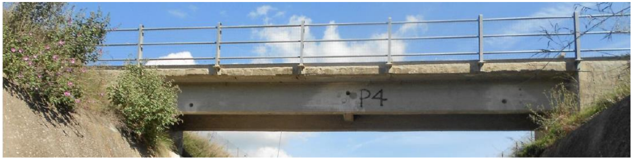
Figure 2: T1 type bridge.