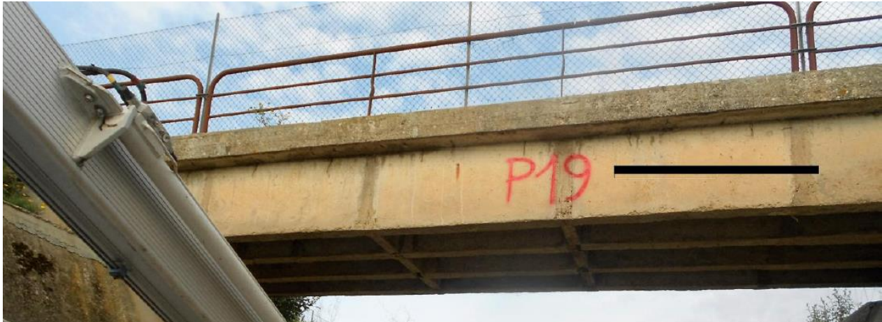
Figure 3: T2 type bridge.

Considering the number of the transverse and longitudinal beams the bridges can be divided in three types as reported in Tab. 4.