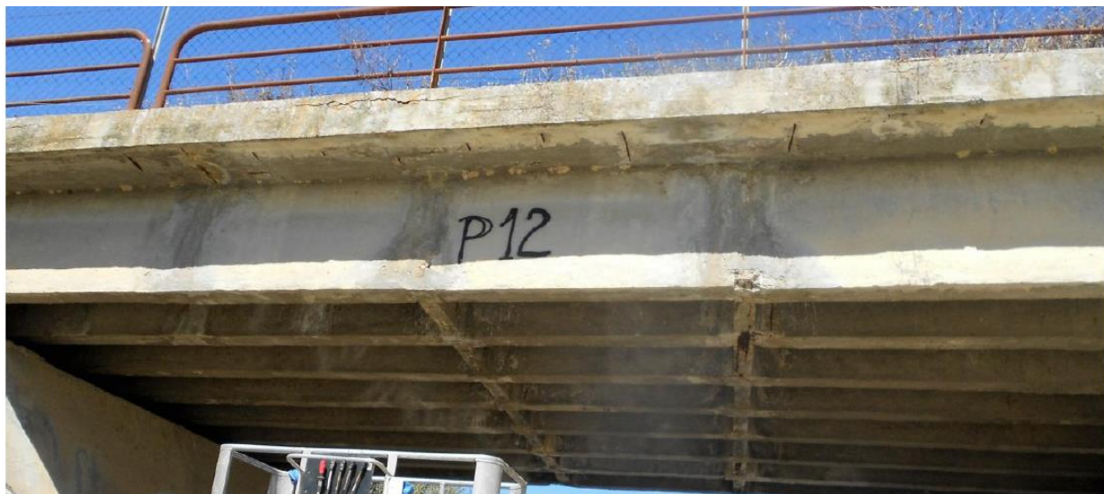
Figure 4: T3 type bridge.

The design material resistance is not available, thus given the exposure class XC4, see [18], the minimum resistance class was assumed as the material strength reference class C30/37. For the sake of simplicity, the scale constant \gamma has been considered equal to one.