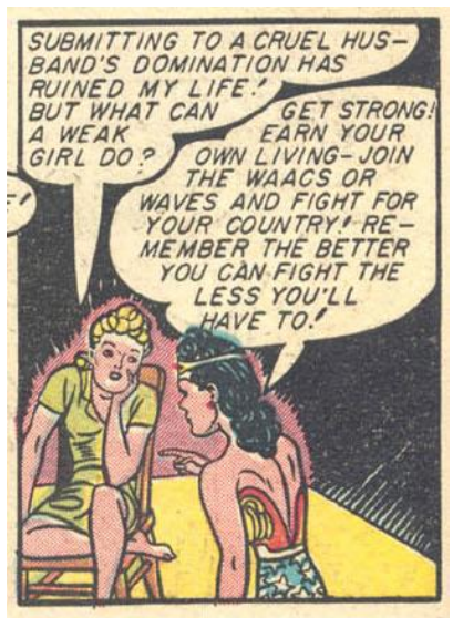
Figure 2. "... A Cruel Husband's Domination ... " from Wonder Woman #5 (June/July 1943)

Wonder Woman counsels her to become strong and independent, so she needn't feel pressure to be ruled by domination.