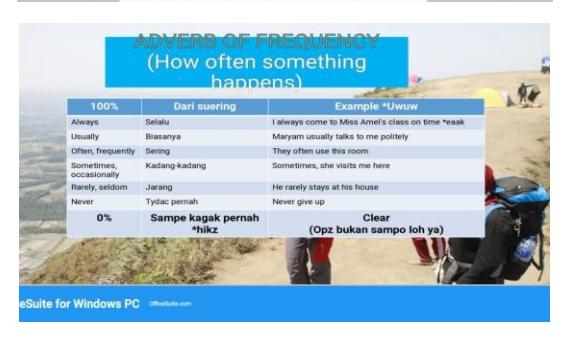
Figure 3. Material Content Presented by LEE

Student from Makasar, Sulawesi Selatan wrote her opinion "My experience studying English in LEE two nights makes me thankful. I can join this group, and I can improve my