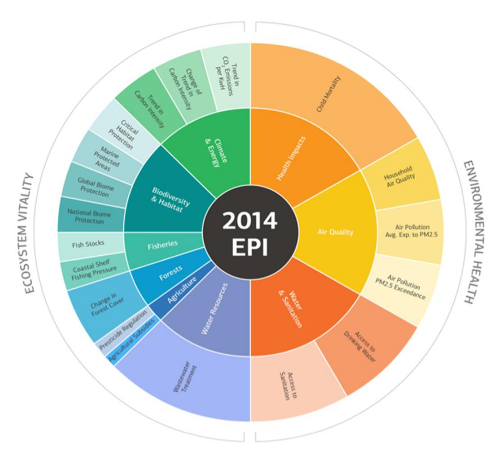
Fig 1 The structure according to the EPI report from 2014.

In general, the EPI index is a powerful tool for managing a particular country and the world as a whole, with reference to the concept of sustainable development. The Environmental Performance Index strives to meet the needs of the governments to monitor the achieved environmental performance, and offers a method for assessing the effectiveness of environmental policies. It is especially designed to help policy makers to: 1) notice the current problems and identify priorities in environmental protection; 2) control the pollution of natural resources; 3) discover the most successful areas of environmental policy, and, where it is necessary, stop the ineffective efforts (Environmental Performance Index, 2008). The EPI methodology was developed through collaboration of the World Economic Forum with the Yale University and Columbia University. The data used for calculating the values of the EPI index has been obtained from the governments of countries, and it includes statements regarding environmental performance indicators.