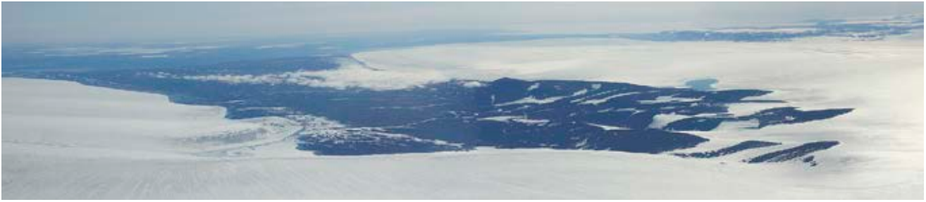
Fig. 2. Aerial view of Kilen, a key area for understanding the geology of the Wandel Sea Basin with exposures of Triassic to Cretaceous sediments. Kilen is approximately 10 \times 30 km large and is surrounded by glaciers except to the south-east that faces the Northeast Water polynya. View towards the south. For location see Fig. 1.

out in collaboration with GEUS (Christiansen et al. 2006; Gautier 2007; Gautier et al. 2011; Christiansen 2011). The seismic coverage of the North-East Greenland shelf is scattered and there are no wells. Therefore an understanding of the onshore geology is indispensable to construct analogues for the offshore basins. Geologists from Danish research institutions have worked in NE Greenland for over a century, and the accumulated sample and knowledge base at GEUS is the largest existing geological database for Greenland. In 2008, a project was set up at GEUS to systematise relevant available data and samples from this database, which contains results from onshore field work, core drilling and subsequent analyses. The aim was to use this material as a starting point for addressing key risks and uncertainties for future offshore exploration. Risks for offshore NE Greenland petroleum exploration include in broad terms: (1) the distribution, quality and correlation of the main Upper Jurassic – Lower Cretaceous source rock units, which have an important bearing on the nature of the petroleum products generated, (2) the nature and stratigraphic distribution of potential reservoir and seal rocks (and possible source rocks), primarily in the rather poorly known Cretaceous succession, which is very thick according to the only published seismic interpretation of the Danmarkshavn Basin (Hamann et al. 2005) and (3) the subsidence and exhumation history of North-East Greenland.