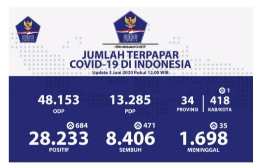
Figure 2. The number of positive COVID-19 cases in Indonesia as per June 3, 2020 at 12.00 AM WIB.

The Covid pandemic causes a fluctuating number death. Figure 2 shows that from 34 provinces in Indonesia, of 28,233 infected with COVID-19, around 1,698 died (6%) (Ministry of Health, 2020).