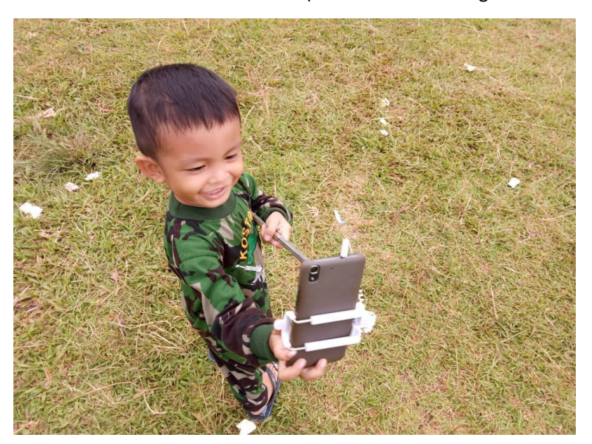
Figure 4. Child using gadget

Online learning or distance learning itself aims to meet of the use of information technology connecting students and teachers. Educators, parents and children change learning modes with various online methods such as Whatsapp application, Zoom Meeting, Google Classroom, Email, and other applications. As a result, time and space of using the gadgets or laptops are inevitable (Basilaia, G. & Kvavadze, D., 2020).