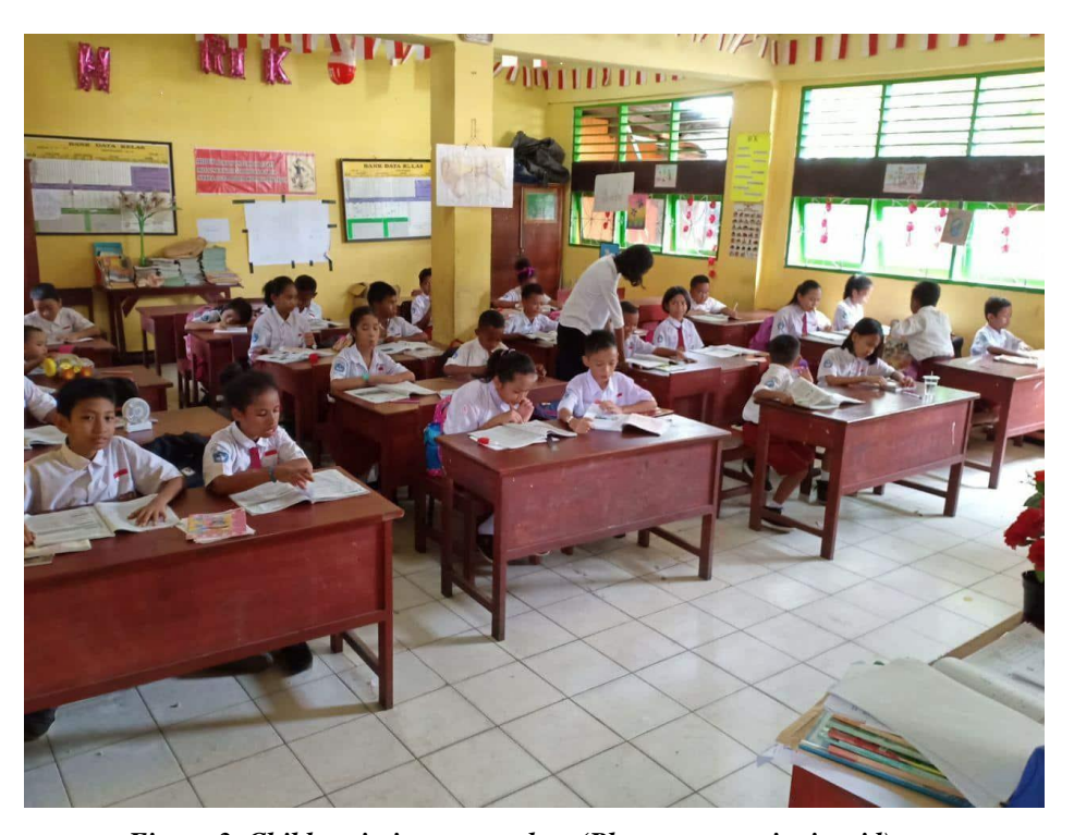
Figure 3. Children in in-person class

The Covid pandemic causes a fluctuating number death. Figure 2 shows that from 34 provinces in Indonesia, of 28,233 infected with COVID-19, around 1,698 died (6%) (Ministry of Health, 2020).