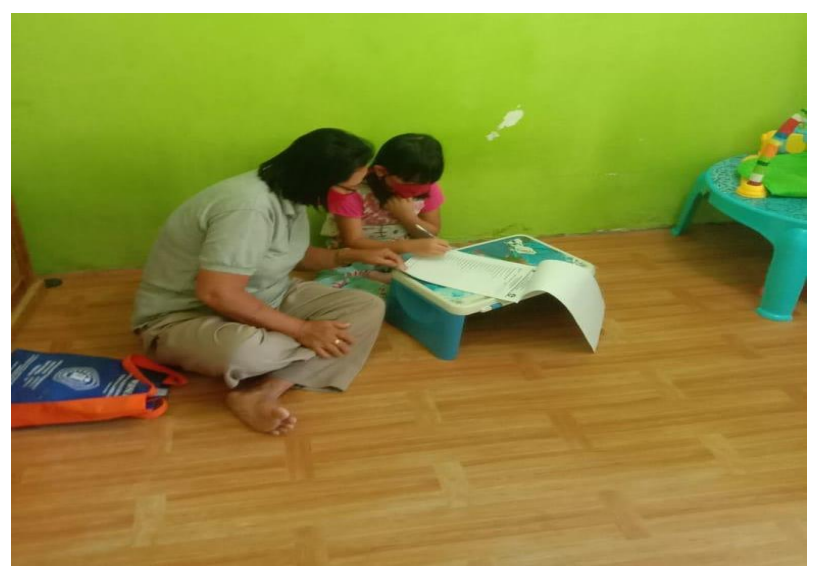
Figure 6. Parental assistance in online learning from home during the pandemic

Overcoming future impacts of online learningshould be our concern. According to Law No. 20 of 2003 concerning the National Education System, education is a conscious and planned effort to create a learning atmosphere and learning process so that students actively develop spirituality, self-control, personality, intelligence, noble character, and useful skills for themselves, the society, and nation. Recommendations such as studying with siblings may instill the spirit of learning and social sensitivity.