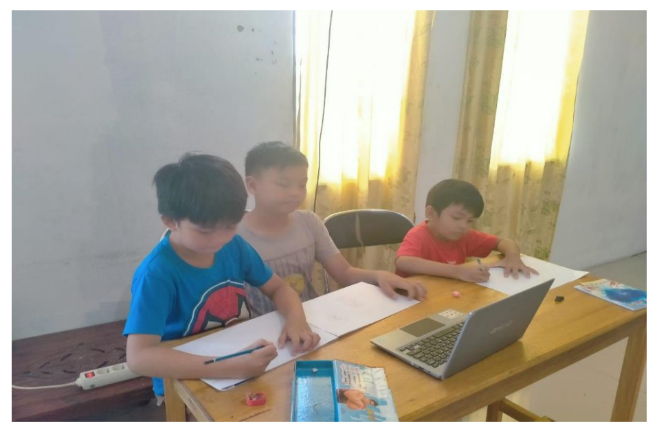
Figure 5. Online learning with siblings at home during the pandemic

Overcoming future impacts of online learningshould be our concern. According to Law No. 20 of 2003 concerning the National Education System, education is a conscious and planned effort to create a learning atmosphere and learning process so that students actively develop spirituality, self-control, personality, intelligence, noble character, and useful skills for themselves, the society, and nation. Recommendations such as studying with siblings may instill the spirit of learning and social sensitivity.