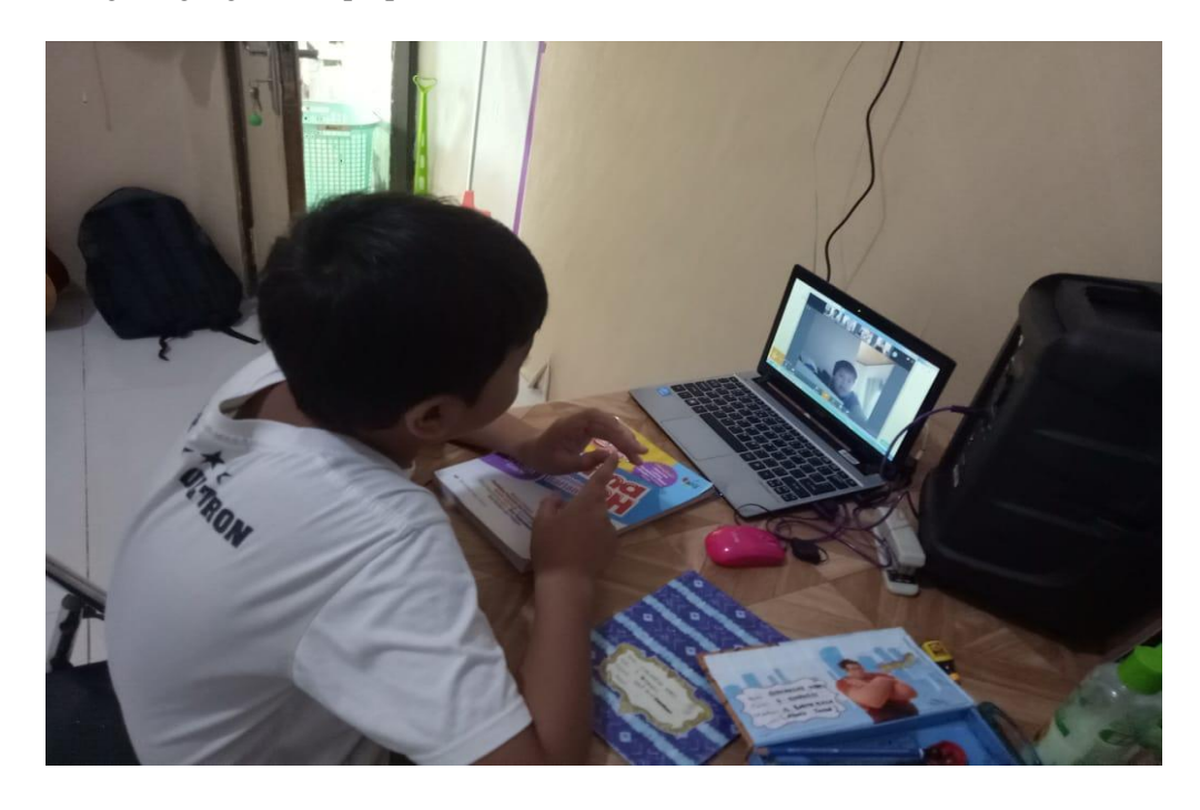
Figure 4. Online learning decreases children's learning experience (Wiresti, 2020; Wulandari and Purwanta, 2020).

Online learning or distance learning itself aims to meet of the use of information technology connecting students and teachers. Educators, parents and children change learning modes with various online methods such as Whatsapp application, Zoom Meeting, Google Classroom, Email, and other applications. As a result, time and space of using the gadgets or laptops are inevitable (Basilaia, G. & Kvavadze, D., 2020).