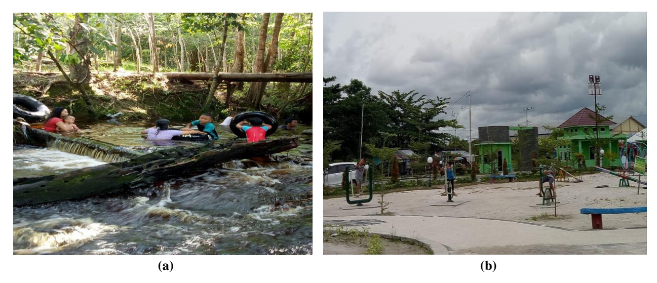
Figure 7. Children playing and observing out door in river (a) and amusement park (b) with friends before pandemic