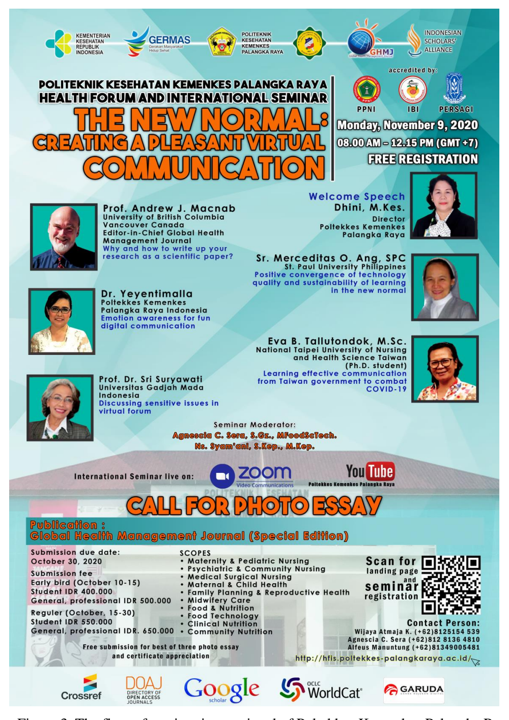
Figure 3. The flyer of seminar international of Poltekkes Kemenkes Palangka Raya

selecting the high promising papers, we believe summarizing a seminar or conference, will share the knowledge and experience the young investigators to the broader audience (Macnab, 2017). We held several meetings in the Zoom room with Bang Doni and on D-1 with seminar speakers. We view that the strong family atmosphere is very conducive to the holding of the seminar. We build on and appreciate all the good that comes our way.