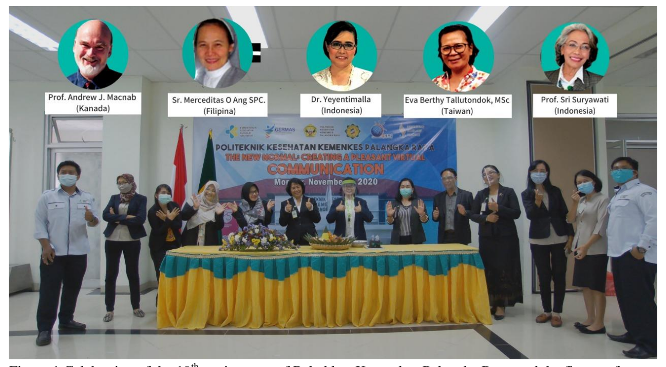
Figure 1 Celebration of the 19<sup>th</sup> anniversary of Poltekkes Kemenkes Palangka Raya and the first conference

©Yayasan Aliansi Cendekiawan Indonesia Thailand (Indonesian Scholars' Alliance). This is an open-access following Creative Commons License Deed - Attribution-NonCommercial-ShareAlike 4.0 International (CC BY-NC-SA 4.0)