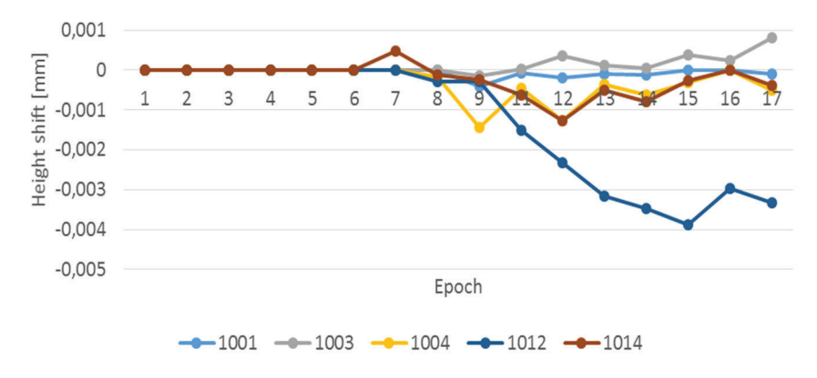
Figure 2: Example of the relative points' shifts

The calculation results are determined corrections after the transformation, which can be interpreted as deviations of individual points from the common state from a common level.