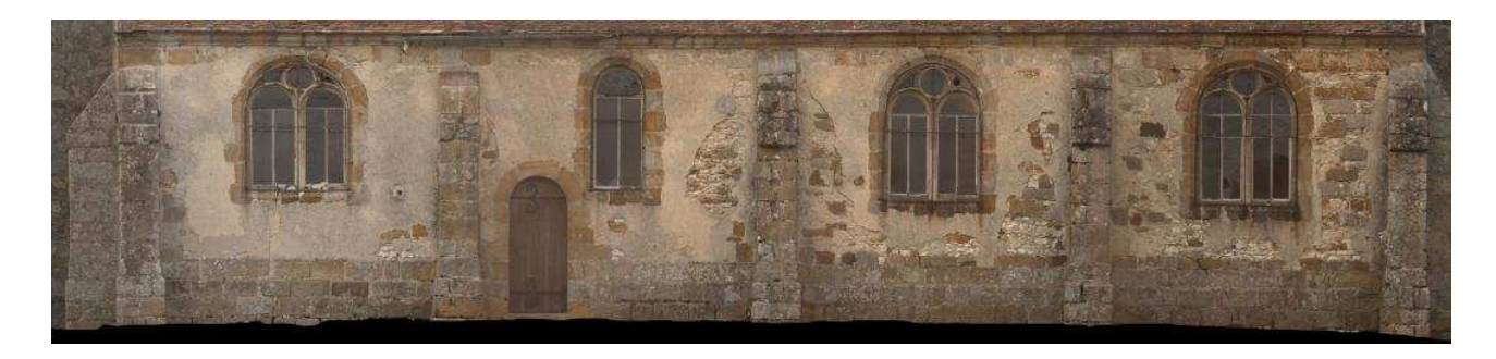
Figure 4: A typical orthoimage generated by orthographic projection of a dense point cloud.

Due to the high density of the produced point clouds, the orthoimage generation is simply based on an orthographic projection of the results. The final image resolution is calculated according to the 3D point cloud density (near to the initial image footprint). Several point clouds (related to several master images) are seamless assembled in order to produce a complete orthoimage of surveyed scene (Figure 4).