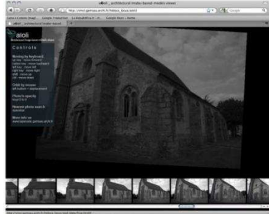
Figure 5: GUIs integrated into NUBES Forma (Maya plug-in) developed at CNRS MAP-Gamsau Laboratory for image-based 3D reconstruction (a) and a web-viewer for image-based 3D navigation and point clouds visualization (b).