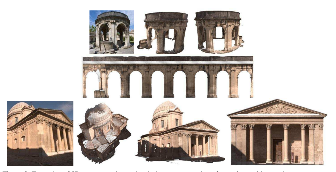
Figure 8: Examples of 3D reconstruction and orthoimages generation of complex architectural structures.

The results showed in this article are based on multiple contributions coming from students, engineers and young researchers. Authors want acknowledge in particular Isabelle Clery (IGN) and Aymeric Godet (IGN/MAP) for their contributions on informatics implementation; Nicolas Nony (MAP), Alexandre Van Dongen (MAP), Mauro Vincitore (MAP), Nicolas Martin-Beaumont (IGN/MAP) and Francesco Nex (FBK Trento) for their essential contributions on the protocols and case studies.