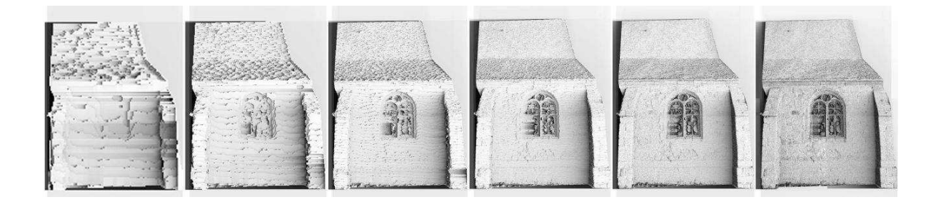
Figure 2: Example of the pyramid approach results for surface reconstruction during the multi-scale matching.