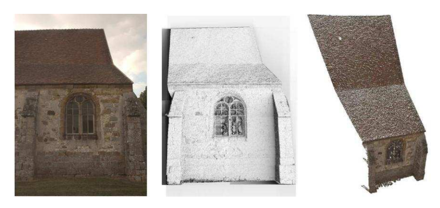
Figure 3: The multi-stereo image matching method: the master image (left), the matching result (in term of depth map) in the last pyramidal step (center) and the generated colorized point cloud (right).

Starting from the derived camera poses and multi-stereo correlation results, depth maps are converted into metric 3D point clouds (Figure 3). This conversion is based on a projection in object space of each pixel of the master image according to the image orientation parameters and the associated depth values. For each 3D point a RGB attribute from the master image is assigned.