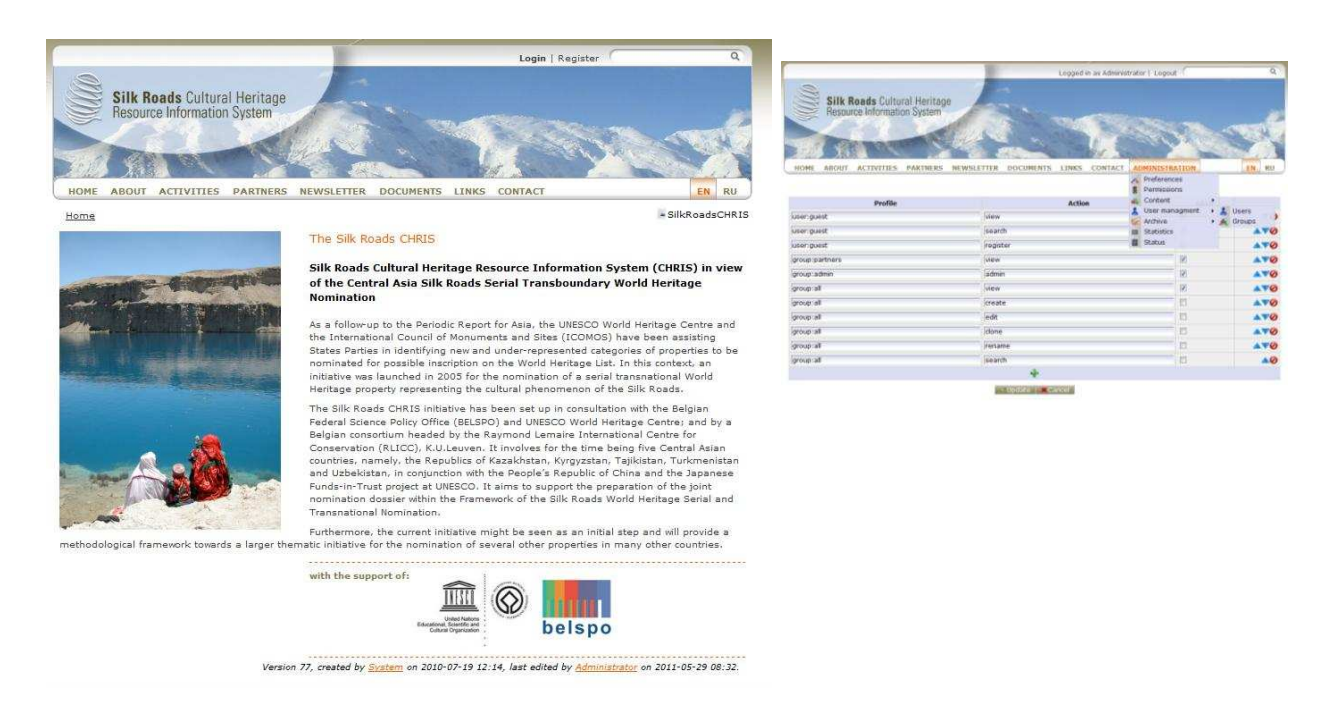
Figure 3: Silk Roads CHRIS Information Management System. Powered by GIM. <a href="http://www.silkroad-infosystem.org">http://www.silkroad-infosystem.org</a>