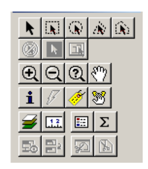
Fig.11 MapInfo 8 toolbar.