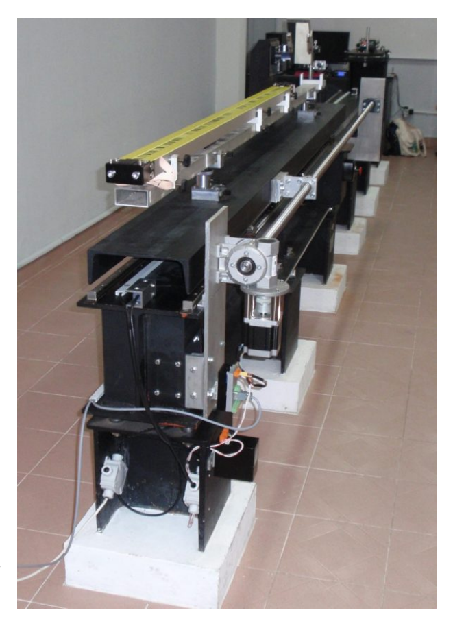
Figure 3: Comparator in Laboratory of JUPEM.

In consideration of preparation heftiness there were all mechanical parts of innovation prepared in advance in the Czech Republic and sent to JUPEM. The fitting of components, the montage and the adjustment took nine workdays. In regard of robust material used for the body of the comparator (steel) and new items (hard –aluminum) are all parts connected with screws in coils or with nuts.