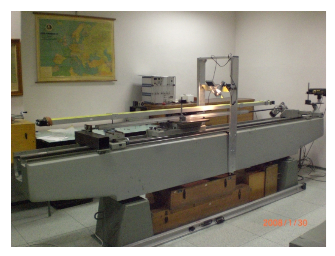
Figure 2: Comparator in laboratory of the Department of Geomatics.

system calibration of digital levels. It was negotiated with the submitter that the automatic system will be built on the current platform of horizontal comparator. It was realized in metrological laboratory in 80's by an expert group from Japanese GSI, see Fig. 3.