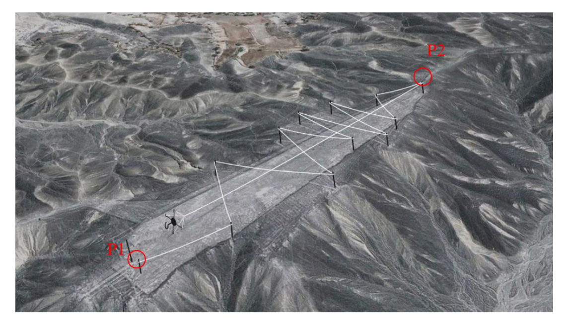
Figure 2 a: Work area near the ropemakers' homes (here near town now known as Palpa). Large trapezoid at \varphi = 14^{\circ}33'54'' S, \lambda = 75^{\circ}11'33'' W, one of the places where pieces of wood for the <sup>14</sup>C test were collected in 2012. Snapshot by © Google Earth. Drawn by © J. Sonnek. The circles P1 and P2 show locations of two of wood remnants tested (see table below). More than one instrument may work simultaneously there.

The string threads may lie on simple racks, which keep the threads apart. No landscaping at all is required for this production procedure. The string being produced will be a little saggy between distant racks, but that does not prevent it from continuing through the rolling terrain in a straight line. This explains the longest straight lines found on the plateau. The ropemakers many times repeated 'ambles along the stretched strings' resulted in pale lines on the ground: the numerous traces across the plateau. They are more prominent along the edges, because the makers would walk on either side of the strings being made, and they are not as accurately straight as those created artificially.