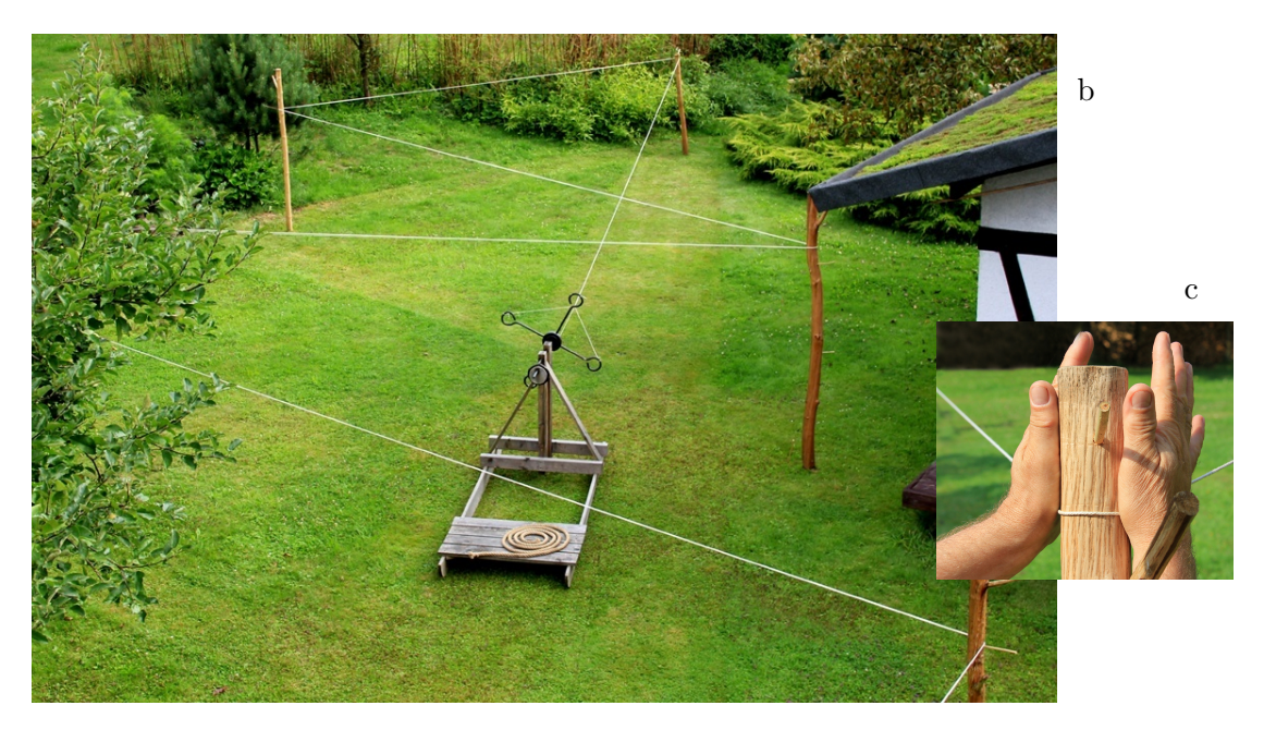
Figure 2 b, c: One of Sonnek's experiments © to make a long string, using a device inspired by the geoglyph discovered on pampa (shown in Fig. 1a); (c, right) the rope at the turning point.

The more laborious rope production (assistants had to turn the rope around the poles in the zigzag turnings with their palms, Figure 2c) was compensated for by easy access and other advantages. Traces left in the terrain indicate how the work areas improved over time. The flat area is optimally utilized and the work area is designed to allow the production of the longest string possible. The narrow work triangle for the travel of work devices is 800 m long and makes use of the entire length of the appropriate work area. The rope may be reduced in length by the length of the work triangle; the twisting device would hit the pole at the end of the line if any longer rope was made. The spiral logo connects to the geometric lines where the completed ropes end. Due to insufficient flat area, it is situated so that it partly interferes with the triangular work area in a place where it presents no obstacle. The zigzag spanning the entire flat area is the tidy path around the forked poles on which the rope threads were hung. It was traversed by the ropemakers while extending the threads and turning the rope. All the poles were installed on the inside of the path turnings.