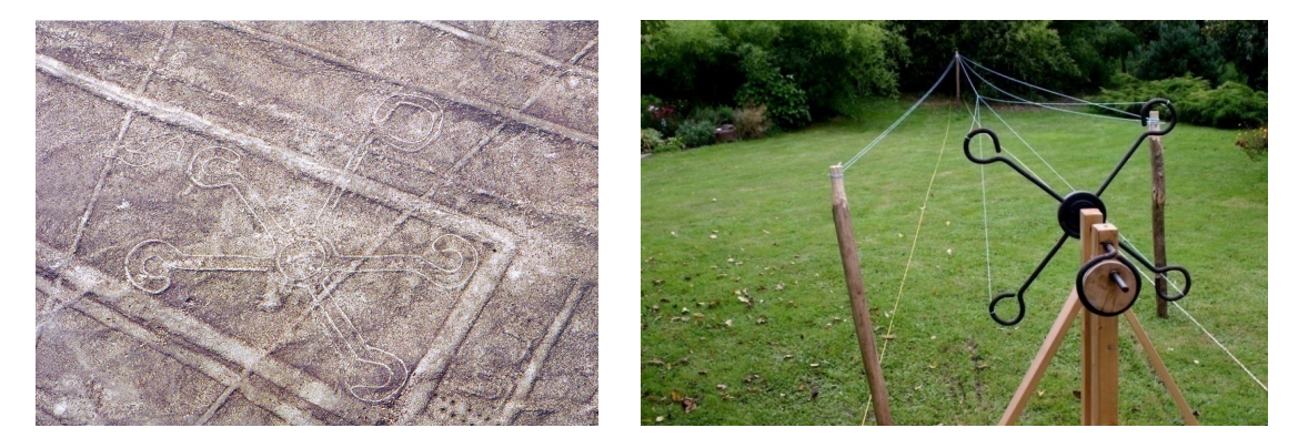
Figure 1 a, b: Left: a technical object – one geoglyph on the pampa. © Google Earth: geographic latitude \varphi = 14^{\circ}33'32'' S, longitude \lambda = 75^{\circ}10'40'' W. Right: a functional model of a rope twister made from metal (in a convenient size) after the geoglyph on pampa (a), for experimental rope making. The original material may have been hard wood. © J. Sonnek, 2013.

Four spun threads, connecting the pole at the tip of the triangular sector and the rope twister installed in the wooden skid frame, twisted to the right. The twisting reduces the thread length, so that the skid is pulled towards the pole at the end of the line and keeps the twisted threads tight. This first twisted strand had to be attached to a prepared pole; otherwise, it would untwist and produce kinks. Three more strands were twisted in an identical fashion and then all the four, right-twisted strands were again fastened to the twister lugs. By now twisting to the left, we produced rope that no longer came untwisted. The left twisting reduced the length of the rope, meaning the final rope is 8-30% shorter (depending on the rope diameter) than the threads before twisting. Our experimental twisting of ropes of various thicknesses, using the twister, not only confirmed the perfect functionality of the device, but also led to several interesting findings.