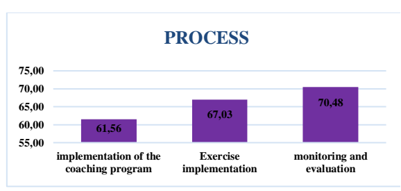
Figure 3. Histogram of Process Evaluation Results

Based on the results of the input evaluation, it can be concluded that it is running well and as expected. The input from the program implementation and training implementation was good, as evidenced by the obtained scores of 64.56 and 67.03, while the monitoring and evaluation process had a value of 70.48 categorized as good. So the