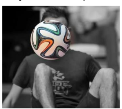
Figure 3. Sitting