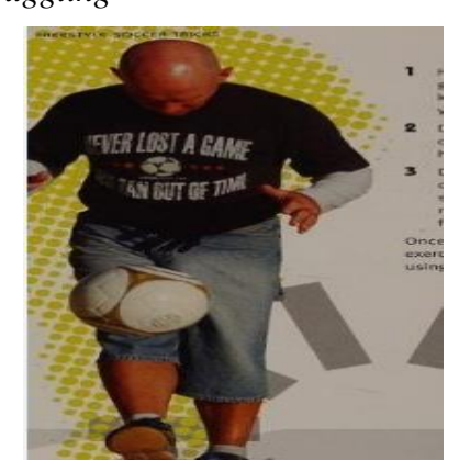
Figure 7. Juggling