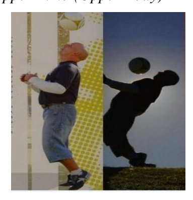
Figure 2. Upper Body