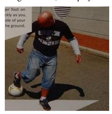
Figure 5. Set Up / Flick Up