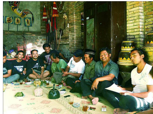
Figure 2. Discussion Between Members of the Lima Gunung Community

managing the community by making the value of togetherness a binding, causes the chairman's role to be less significant. Even in the extreme, without a chairman, the Lima Gunung Community art activities can continue. In Figure 2, there is a discussion situation conducted by members of the Lima Gunung community.