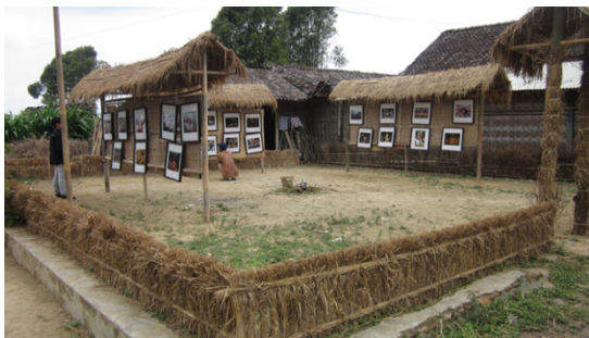
Figure 4. Photo Exhibition by Cultural Journalists

as to produce creativity to encourage the vitality of the mountain community becomes an elemental force. Panutan are role models used by the community as a source of reference in creating works. Panutan contains life value, in the role model profile is attached to expertise, or the mountain community needs people who have specific knowledge and the figure. As a panutan , Sutanto Mendut can present himself, both physically, emotionally, socially, and culturally in the middle of the five mountains community. The panutan have sufficient experience and ability to understand the village community, such as understanding various kinds of knowledge, potential, and uniqueness of the hamlets, each hamlet, is different. This experience is enough as capital for the community to encourage them to organize a five mountain festival.