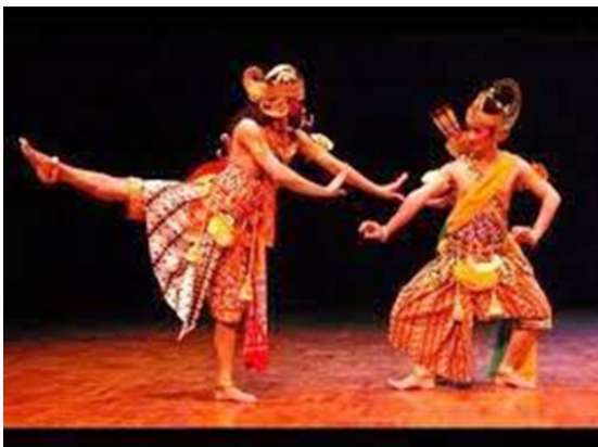
Figure 2. Wirèng pethilan "Bambangan-Cakil" (the telling wirèng )

In sub-sections or war scenes, there are variations in a spatial formation called gawang prapatan (crossroad spaces), gawang jeblos (opponent space/places), and gawang pojok ( pendhapa rectangular corner spaces). After the war scene is finished, they dance again, then it is continued with the final part of the dance ( mundur beksan ); (3) the final part of the dance is the same as the initial part of the dance, namely, the dancer returns to the starting position, gawang sopana . The difference lies in the intended direction, namely the movement in the