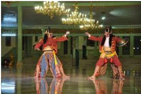
Figure 1. Wirèng "Bandayuda" (non-telling wirèng ) (romadecade.org/tari-beksan-wireng 2021)

wards the essence of the dance ( beksan ); (2) the main part of the dance is that the dancers are in the main gate (middle room/ pendhapa center) doing dances, madas wars , ruket wars , and more dancing. The following is an example of a storytelling wirèng ( pethilan wirèng ) and a non-telling wirèng (See Figure 1 and Figure 2).