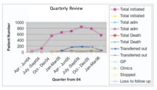
Fig. 2. Quarterly review, April 2004 - March 2006.

Clinicians working in areas where the prevalence of HIV is high, specialist support is scarce and ARV rollout is expanding require ongoing training, as a patient can incidentally be found to be HIV positive (asymptomatic or on therapy) and present with a non-HIV-related ailment or with various 'sub-specialist complaints' (pericardial TB, spinal TB, renal failure, etc.) directly attributable to HIV or its related opportunistic diseases or effects of therapy.