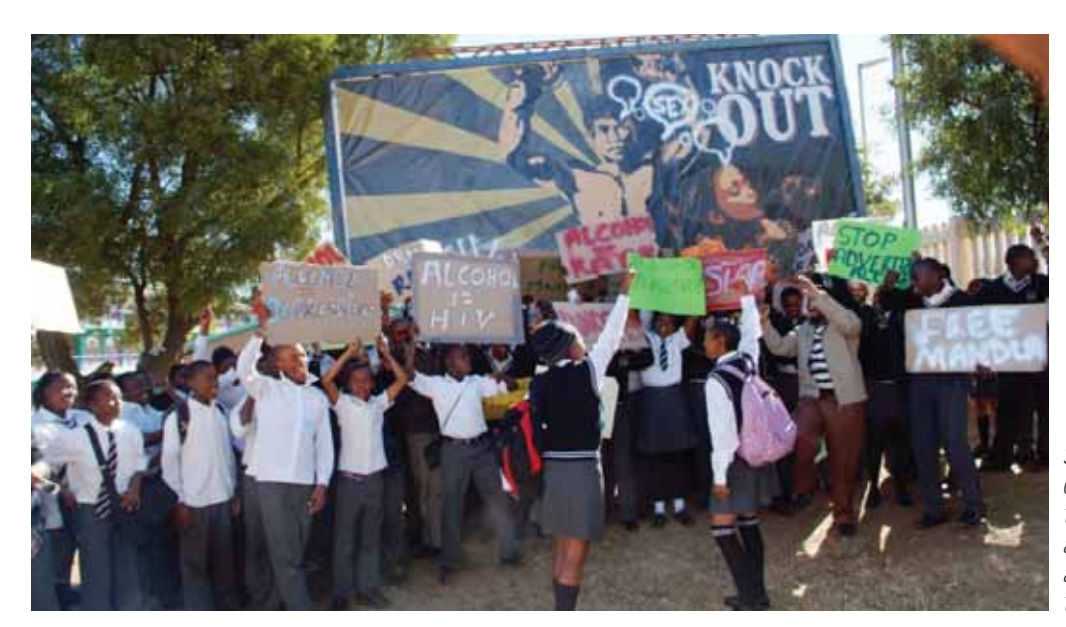
Schoolchildren campaign against the abuse of alcohol and alcohol advertising near their school.