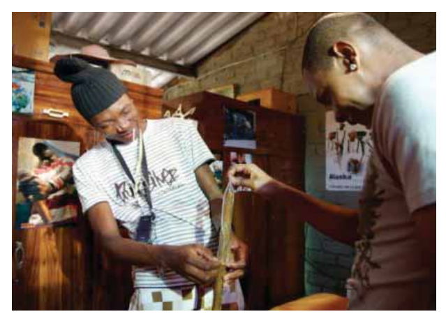
Zuko and his friend Mandla play with condoms in preparation for 'the real thing'. In this series Mandla and his girlfriend Naledi decide that they would like to start sleeping together, but they want to be 100% safe and 100% sure. Watch to see how they do it.