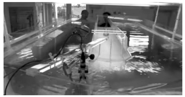
Figure 3: Open grower systems at a refinery