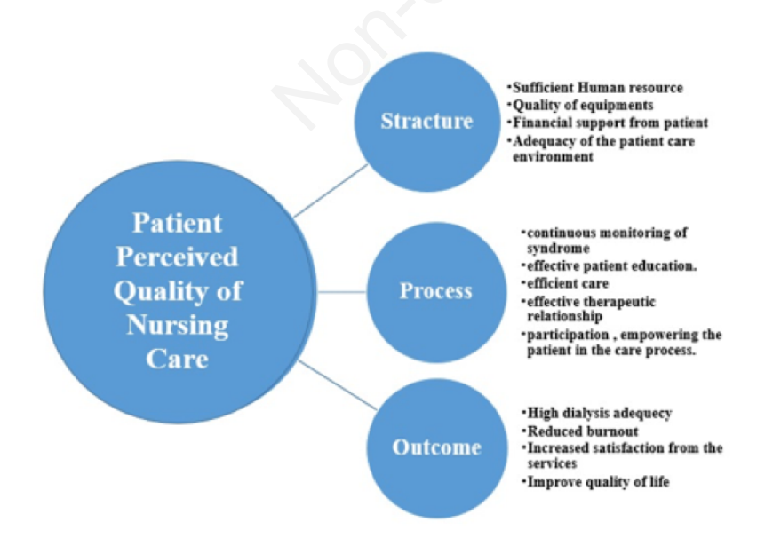
Figure 2. Patients' perceived quality of nursing care concept in hemodialysis patients.

Continuous monitoring of the physical and psychological state of patients before, during and after dialysis is one of the main duties of the therapeutic team, especially nurses, who spend more time with the patient. Patients undergoing dialysis experience usually high stress due to being attached to the device and hemodynamic