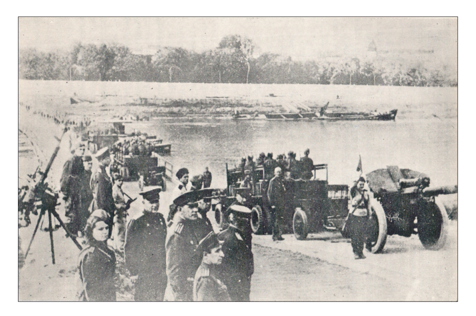
Photo 2. Soviet troops crossing the Tisza river in 1944.

In the first phase of withdrawal the Soviet Army withdrew 22 troops from Hungary: an armoured troop, a descent storming battalion, a chemical protection battalion, a military officer training school and other units (Номов, Gy. 2009; Новуа́тн, M. 2003; Ка́ра́в, K. 2011b). The number of soldiers stationed in Hungary was decreased by 10,000 soldiers and 4,000 civilians also left the country.