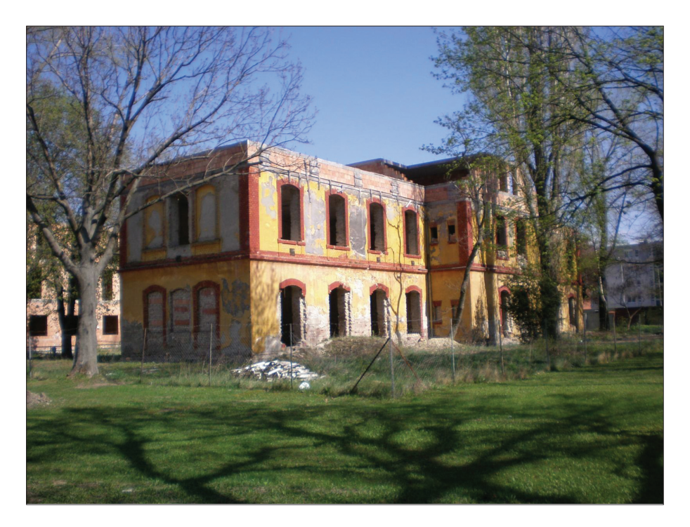
Photo 4. The ruins of a former Soviet kindergarten in Székesfehérvár