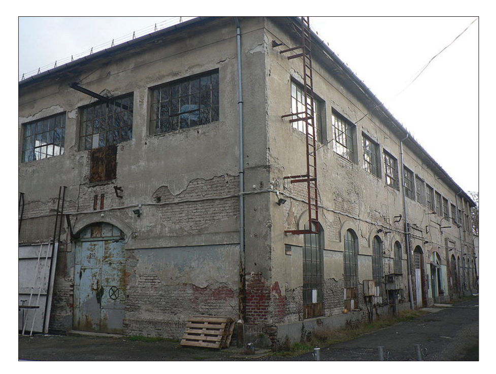
Photo 1. Brownfield area in the Hajógyár Island, Budapest.

Due to deindustrialisation a significant amount of brownfield lands have been produced in Europe since the 1960s and 1970s. After the collapse of communism deindustrialisation also speeded up considerably in post-socialist cities as part of economic restructuring ( Photo 1 ). Problems of brownfield areas have