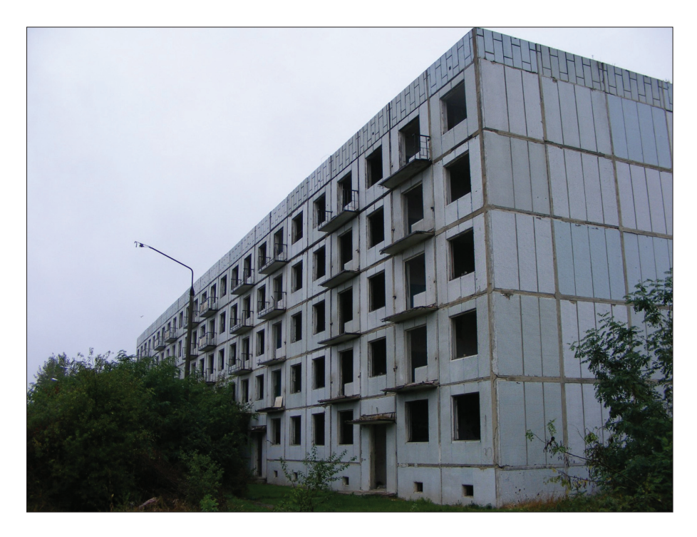
Photo 3. Former Soviet military flats in Szolnok

around 55,000 soldiers and approximately 10,000 civilians on 288 sites, in 104 settlements of Hungary. Based on the research of the National Environmental Remediation Programme made by VITUKI Kht. (NAGY, Á. 2005) 171 former Soviet sites were found in the country. HOMOR (2009) mentions in his book that 100,380 Soviet citizens left the country, including 44,668 soldiers, leaving 94 garrisons vacant. In these garrisons 328 properties were used by the Soviets.