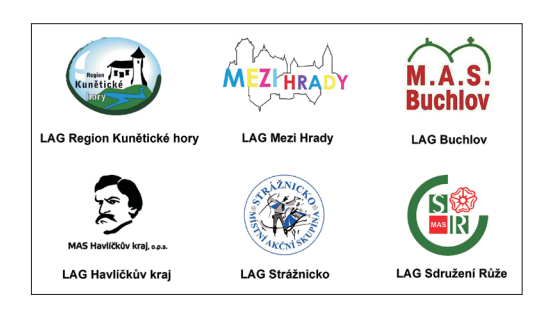
Fig. 2. Selected examples of LAGs' logos with historical elements

A total of 23 LAGs have a logo that evokes history. Of these, only 10 LAGs have names based on history. In the logos, the stylized motif of the monument is used most often (12 times) (e.g. a castle, a manor, a monument, a pilgrimage church), or its silhouette, or its setting into a broader panorama of its land-scape. In most cases, it is a specific building that is characteristic for the region in question (e.g. LAG Kunětické hory; see Figure 2 ).