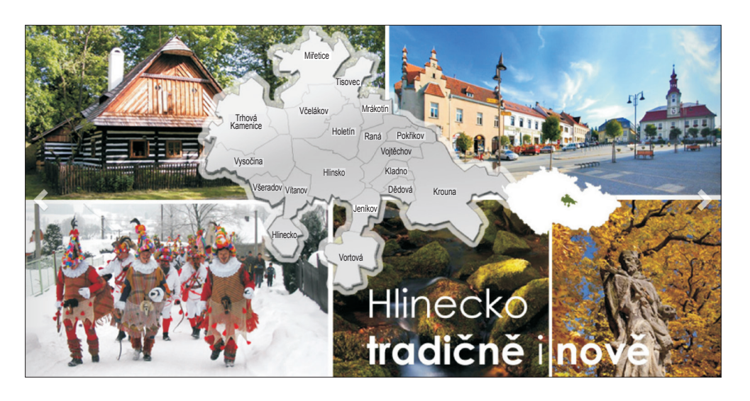
Photo 1. The example of introductory photographs depicting both folklore tradition and historical monument, LAG Hlinecko.

historical or historicizing topics the most. We subjected the selected LAGs to intensive research on how they use history and its reinterpretation in official documents and LAG presentations. We managed to identify several general approaches that can be divided into four topics: monuments, tradition, identity, and historicizing events.