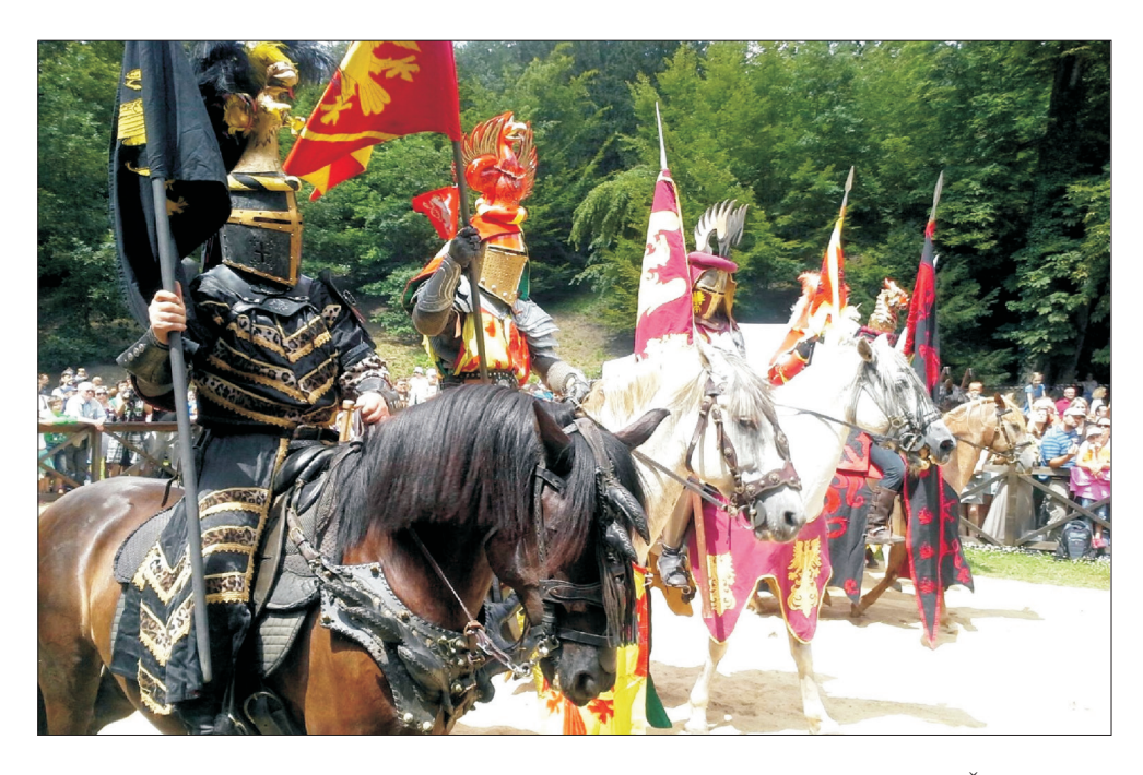
Photo 2. Historic costume is very common way of the commodification of history.

Here, we would like to turn the attention from the commonly used strategies to several specific cases, where the reinterpretation of history is an important component of the LAG's communication strategy. In its presentation, LAG Hlučínsko refers to its peculiar history, which it defines as a "specific historical, cultural, and national development that has no equal in our state". The region's identity is significantly influenced by its position at the border, which changed state affiliation six times since the middle of the 18th century. This history had an impact on its ethnic and linguistic makeup, which, despite the dramatic changes in the 19th century, can still be seen today, including in its folk name "Prajzsko". LAG Hlučínsko used its specific dialect and the region's other characteristics (level of religiosity, inhabitants' feeling of togetherness) in its inward and outward presentation and used them to define itself against other regions. Its specific dialect and historical sign has even made it into the