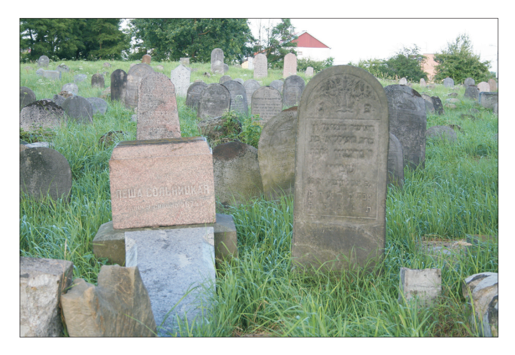
Photo 3. The Jewish Cemetery (Wschodnia street)

Next to the Jewish Trail, other thematic routes focusing on the multicultural character of the city were also created, e.g. the Ludwik Zamenhof and Many Cultures Trail or the Białystok Temples Trail, showing the city's religious and architectural diversity ( Photo 4–5).