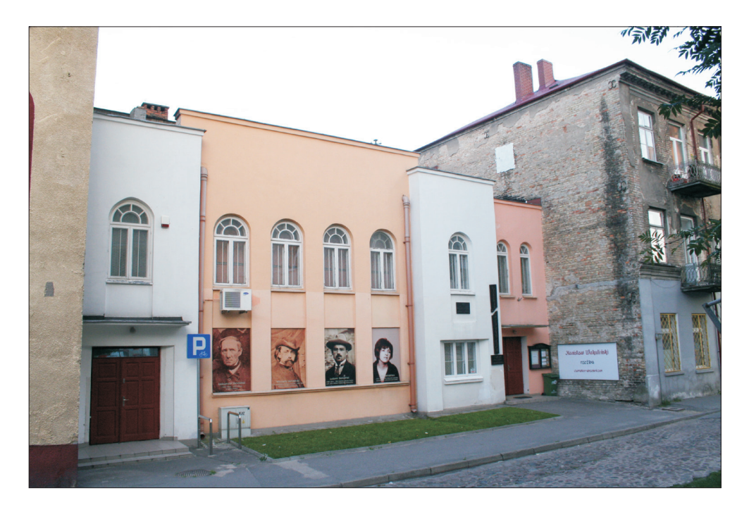
Photo 1. Cytron Synagogue (now Art Gallery of the Slendzinskis)