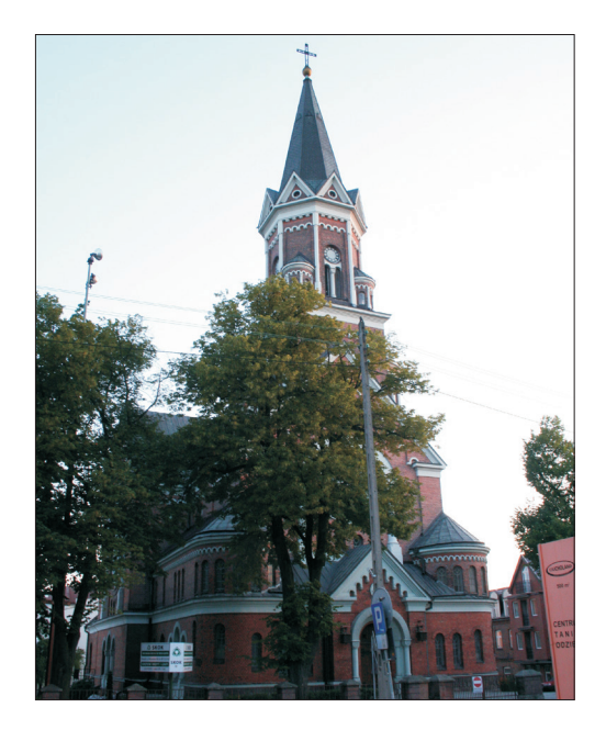
Photo 4. Church of St. Wojciech Bishop and Martyr

Interesting buildings and places, neatly crafted boards, interesting plastic solutions (e.g. murals), along with the information they convey, make the trails an attractive offer for both residents and tourists. In the post-war period Białystok also became the Tatar capital of Poland; numerous cultural events that allow to get to know the Tatar heritage are held here, including, since 2008, the annual Podlasie Days of Muslim Culture. In the Historical Museum, the only Polish permanent exhibition of memorabilia of their culture is open for visitors. In a sense, the trail of Father Michał Sopoćko, a great supporter of the cult of Divine Mercy, who lived in Białystok and was buried there, also fits in with the city's multiculturalism.