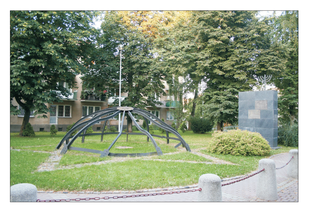
Photo 2. The Monument of the Great Synagogue