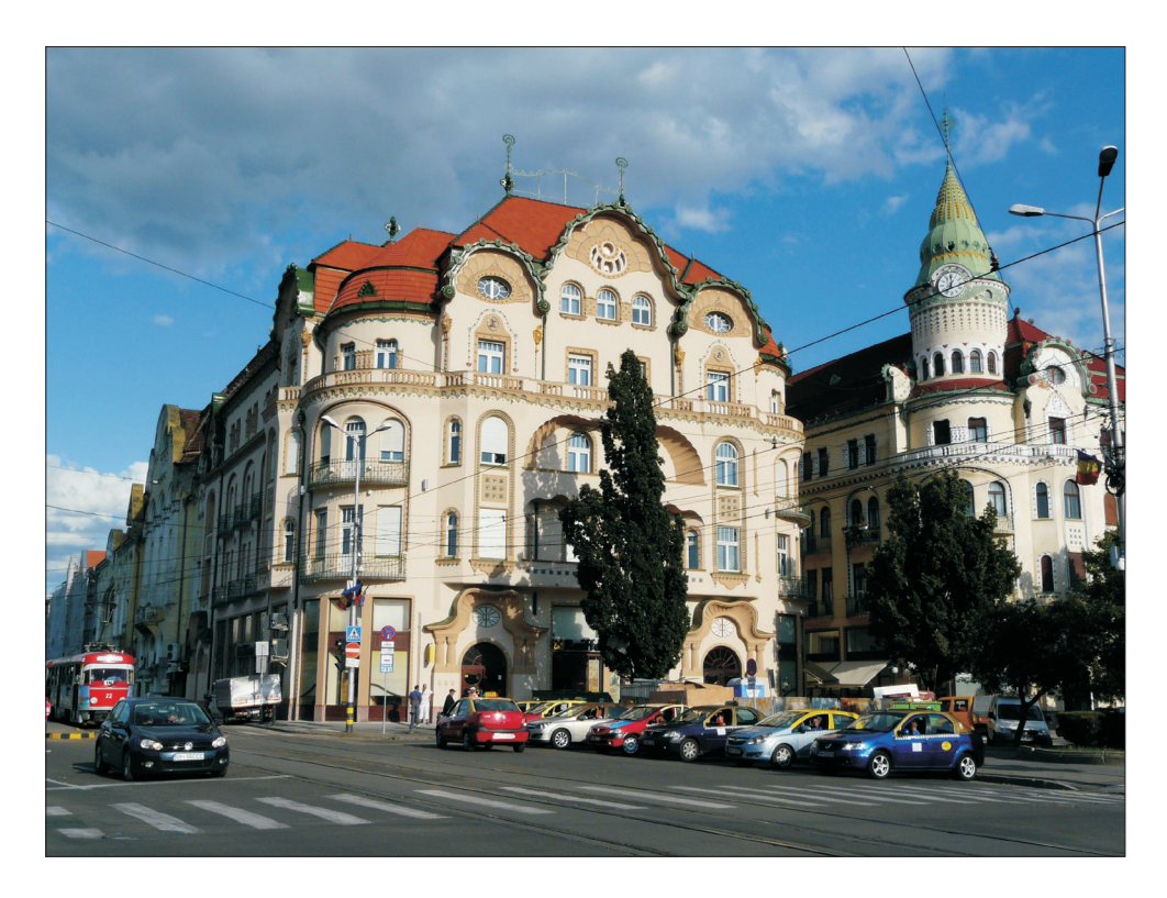
Photo 1. One of the architectural gems of Oradea, The Black Eagle Palace (Palatul Vulturul Negru/Fekete Sas Palota). Built in 1907–1908, architects Marcell Komor and Dezső Jakab.

majority in the local population (VARGA, E.Å. 1999). Probably due to the lack of financial resources (IUGA, L. 2014), a great proportion of historic buildings in the city-centre could avoid demolition; the socialist urbanisation transformed rather the northern and southern parts of the town.