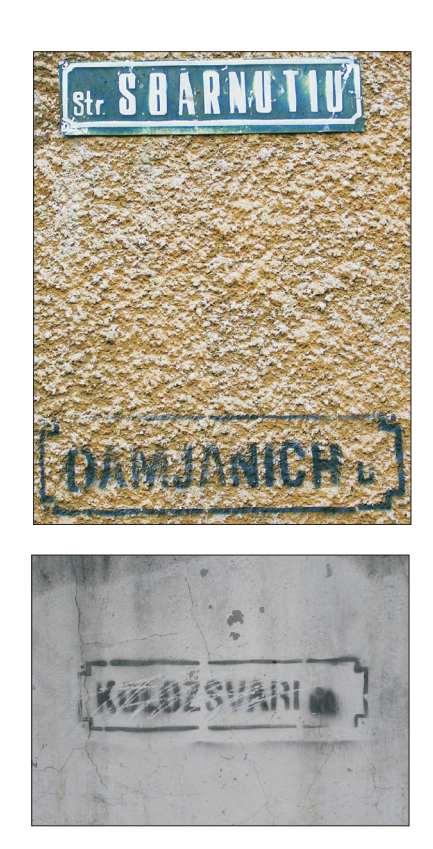
Photo 2. Scenes from the EMI activists' street action. The official (Romanian) street names above, below the once existing, Hungarian street names. The painted signs were either repainted or carved.