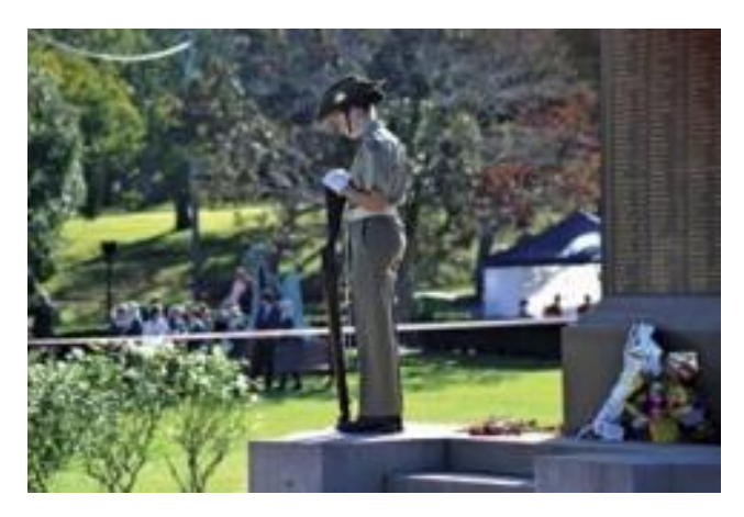
Source D: Cadet at a commemorative service at Fairholme College, Toowoomba. Reference: <u>Cadets.</u> <a href="http://www.fairholme.qld.edu.au/learn/co-curricular-extra-curricular-activites/cadets.html">http://www.fairholme.qld.edu.au/learn/co-curricular-extra-curricular-activites/cadets.html</a>

Corresponding author: melanie.innes@newcastle.edu.au