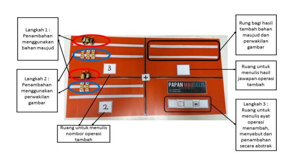
Figure 1. Mauselis Board

The teaching and learning process of mathematic subject among the special needs learners is basically depending on the cognitive development of the learners. Therefore, it is highly recommended for all teachers to follow the CRA strategy in the teaching and learning process, sequencing from concrete material (enactive) to the use of photo or visual diagram (iconic) before the learners are introduced to the representation of symbols (symbolic) (Mohamad et.al, 2009). Therefore, observation approach was used as main instrument for this research to investigate how the MAUSELIS BOARD which highlights on the CRA strategy would help the special needs learners in acquiring the addition-operation in mathematic subject.