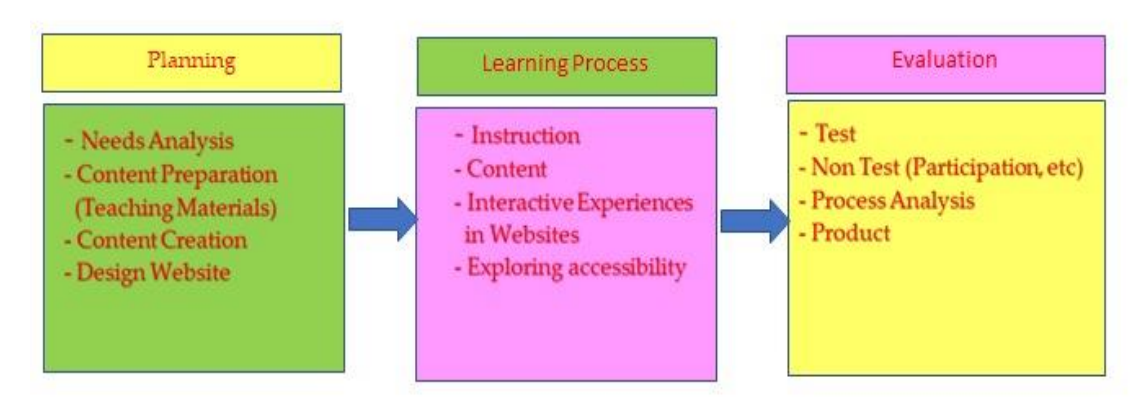
Figure 2. Interactive Web-Based Learning Model

The content on the website is arranged based on the structure of the material in the syllabus so that students can explore the material by browsing all content. The material menu also provides a discussion feature that will discuss experiences and best practices related to the material discussed so that interaction between lecturers and students occurs and the discussion runs asynchronously so that the data is recorded and can be accessed at any time. The final stage is Assessment. The assessment form in the form of a test can be directly accessed on the website and can be filled in in the form of writing, files, or voice notes. In the aspect of assessment, all interactions of students with special needs on this website become a point in the assessment as a form of participation (process) in learning because activities can be recorded and used as the basis for assessment.