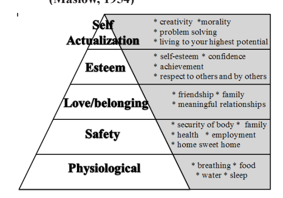
Figure 2 : Maslow Hierarchy of Needs (Maslow, 1954)

In this study, humanistic learning theory by Maslow serves as the backbone of the study. Figure 2 shows the five levels of hierarchy of needs in which introduced by Maslow (1954). This model shows the hierarchy of human needs in order to be happy and successful in life. Maslow (1954) in Mazlina (2014) states that a person will reach the maximum satisfaction if all five stages of the necessities are met. This matter is closely related to a person's self-concept as when the necessities of life are met, then a positive self-concept is formed.