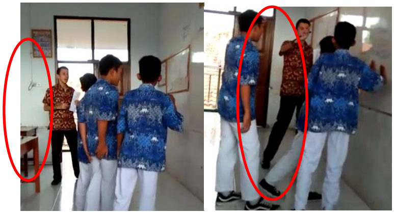
Figure 10. Proxemics

Proxemics is the study of how space and distance influence communication. In the picture, we see the distance comparison performed by the foreign English teacher to the students. He gives space to the students to answer the question on the whiteboard. After the question is answered, the teacher comes closer to the students to explain the answer. He realizes how important the space is in this situation.