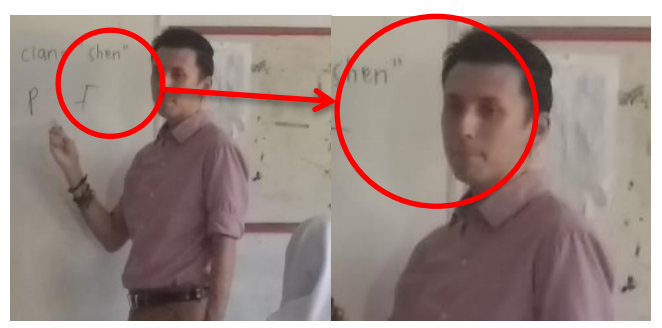
Figure 8. Eye contact

his students. He stands with the hands folded holding marker. With that position, the teacher looks professional and ready for action.