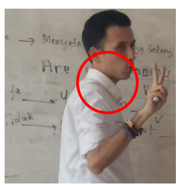
Figure 2. Illustrating "two"

Illustrators are type of gesture used to illustrate the verbal message. Unlike emblems, illustrators do not typically have meaning on their own. Besides, illustrators are used more subconsciously than emblems.