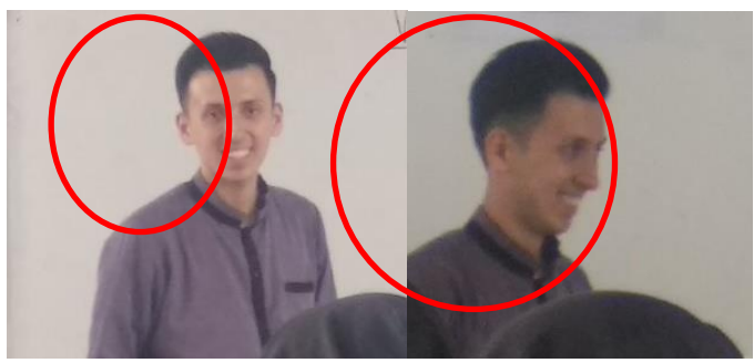
Figure 9. Facial expression

him. Not only to all students, the foreign English teacher also makes eye contact to every student he talks to. Using a picture as media, he stands in front of the student and does eye contact to get student's response. The foreign English does eye contact all the time in the classroom.