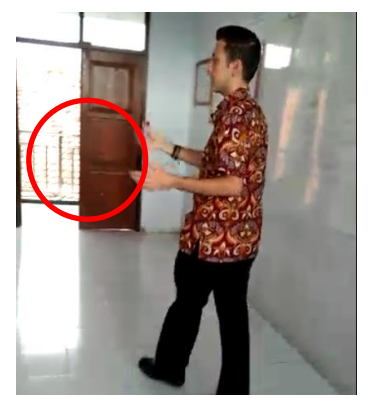
Figure 5. Illustrating "everyone"

illustration gesture can be categorized as a natural gesture flow.