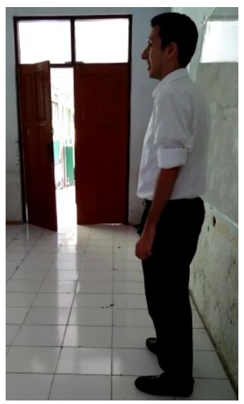
Figure 7. Posture

Standing is one of four general human postures. By standing, the communication occurs perfectly between the foreign English teacher and