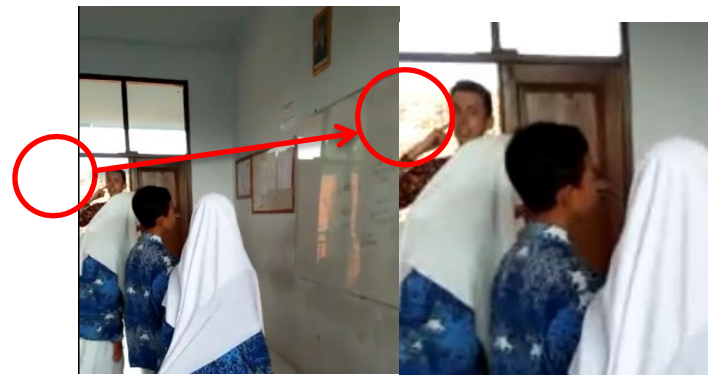
Figure 3. Illustrating "listen"

"two" as a result his students understand the pronunciation of "two" in English and the difference between "two" and "to" is clearly spoken.