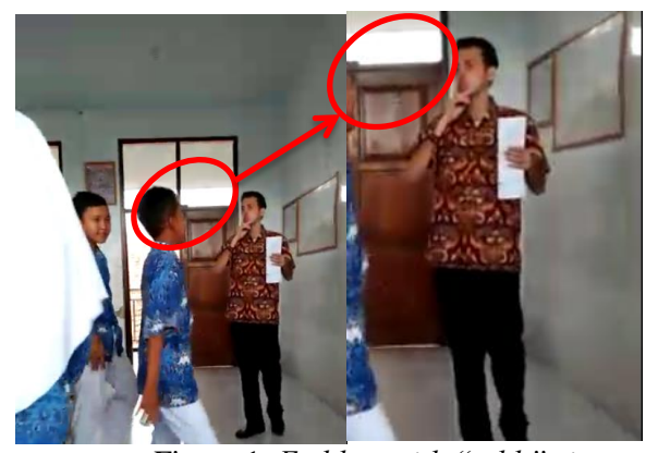
Figure 1. Emblem with "sshh" sign

His index finger on his lips does not indicate any sexual desire. The gesture means he asks his students to be quiet. When the class situation is hectic, this gesture is perfect to be used. It is a "shushing gesture" that is quite common in Indonesia.