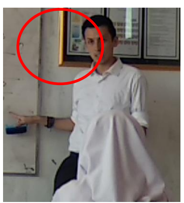
Figure 6. Head nodding

dominantly performed by teacher of English as a Foreign Language Illustrators, it is a gesture of hand and body which naturally flowing with the speech (Rahmat, 2018).