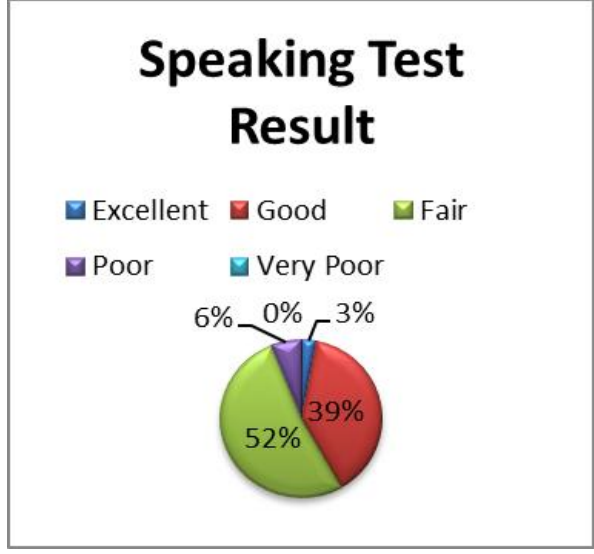
Chart 1. Speaking test results

The results of the speaking test showed that there were 2 students out of 67 or 3% who got the score between 86 and 100. There were 26 students out of 67 or 39% who got the score between 71 and 85. There were 35 students out of 67 or 52% who got the score between 56 and 70. There were 4 students out of 67 students or 6% who got between 40 and 55.