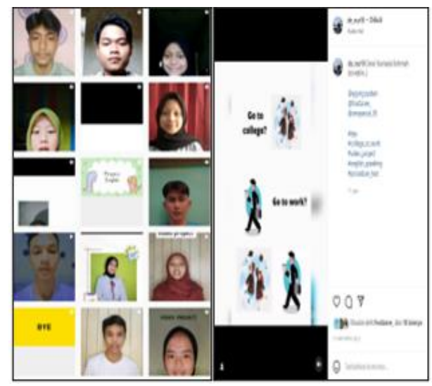
Figure 2. Instagram-mediated PjBL process and progress