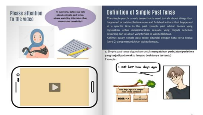
Figure 4. Material content

The cover page described watch which is indicate time. In English grammar, time has substantial role in differencing the utterances or sentences on one's intention in expressing the idea or stating their activity. The differentiate time in grammar called tenses. The material used in flipbook media is simple past tense. Next page is table of content which shows us the whole component in flipbook. Then, we can see the content of the flipbook.