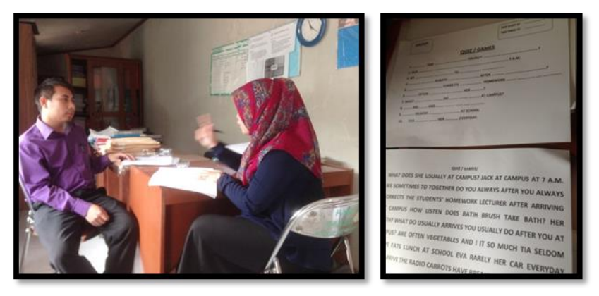
Figure 3. Discussion session and material preparation

would be delivered by one of the researchers as a lecturer of the subjects of the Foundation of English Grammar who will also serve as the lecturer model in the implementation of this lesson study. The design of learning was made by focusing on the importance of teamwork and student discipline. Based on the draft, the lesson study for do in the first cycle requires instructional tools, such as papers containing materials for Jigsaw implementation and lessons learned in group discussions. The researchers should prepare an observation sheet to observe the activities and performance of each group.