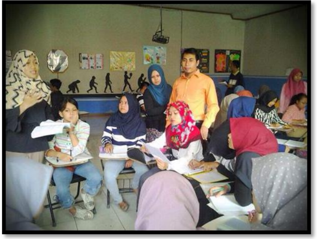
Figure 4. The learning condition in the classroom

results of the discussions that have been carried out by each group. Then, the lecturer concluded and motivated students to work well together.