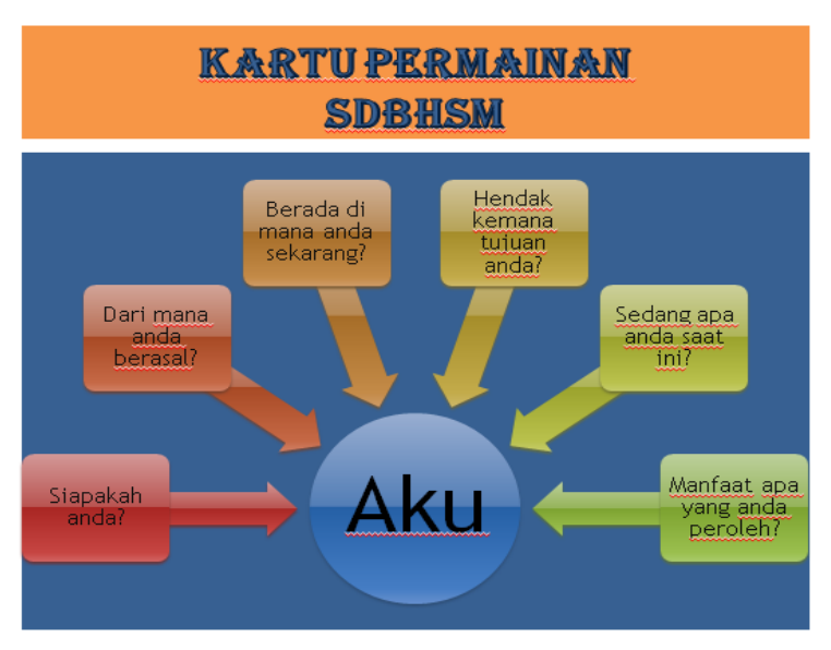
Figure 1. Side A of the SDBHSM (Rahman, 2018)

by being given basic guidance service on the nature of human beings. The last session, participants were asked to answer six questions on the same card inside B to find the most essential and deep answers.