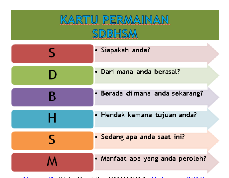
Figure 2. Side B of the SDBHSM (Rahman, 2018)