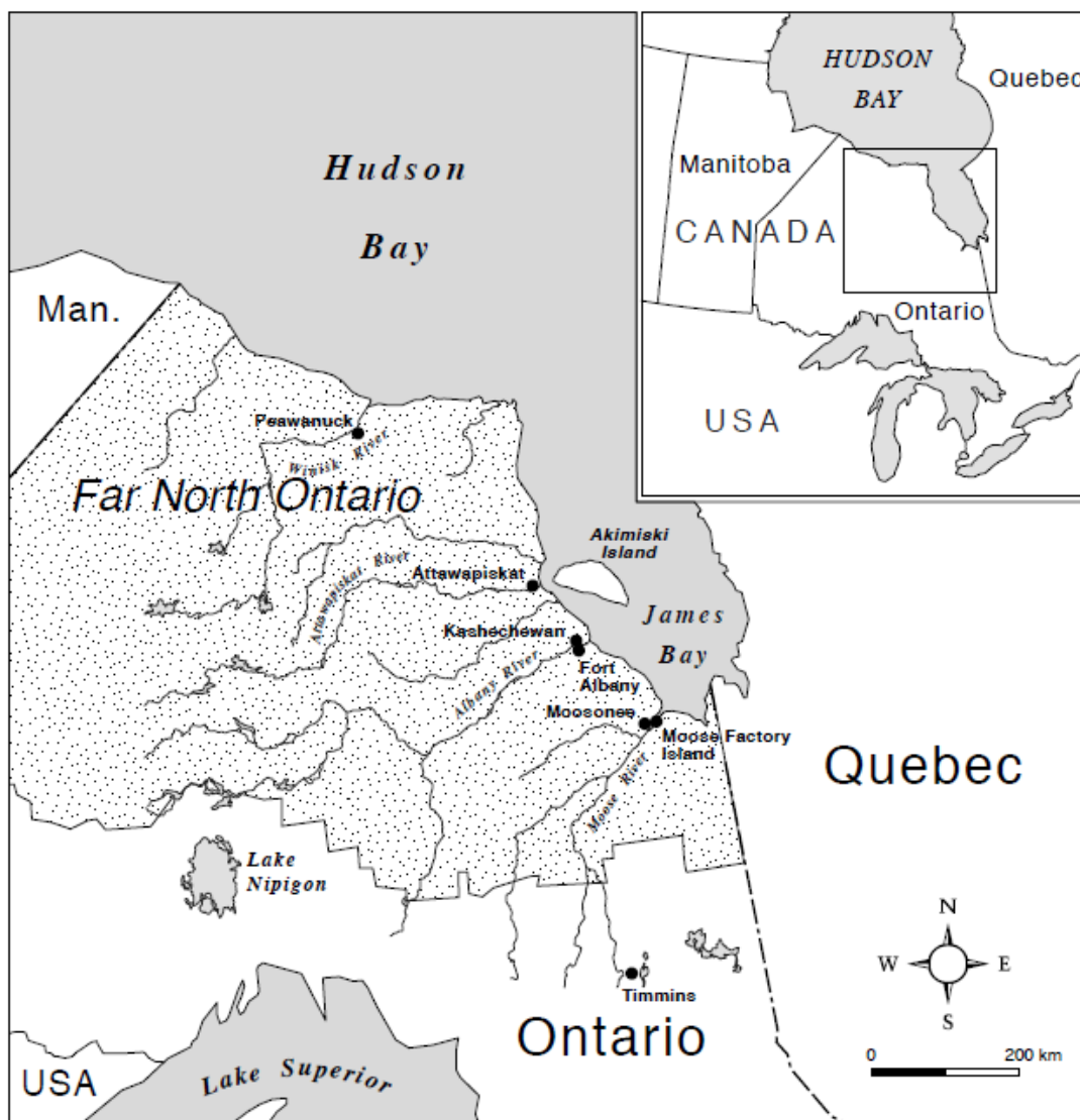
Figure 2. Ontario, Canada, and the Far North of Ontario (stippled area)