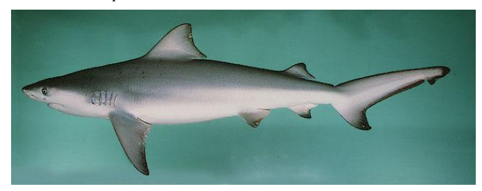
Figure 4. Carcharhinus leucas , Cochin, India, 69cm total length, courtesy of J. E. Randall.

the Tigris-Euphrates basin and Compagno (1984) concurs. Coad and Papahn (1988) and Coad (2010) also list specimens and data which confirm this species to be present.