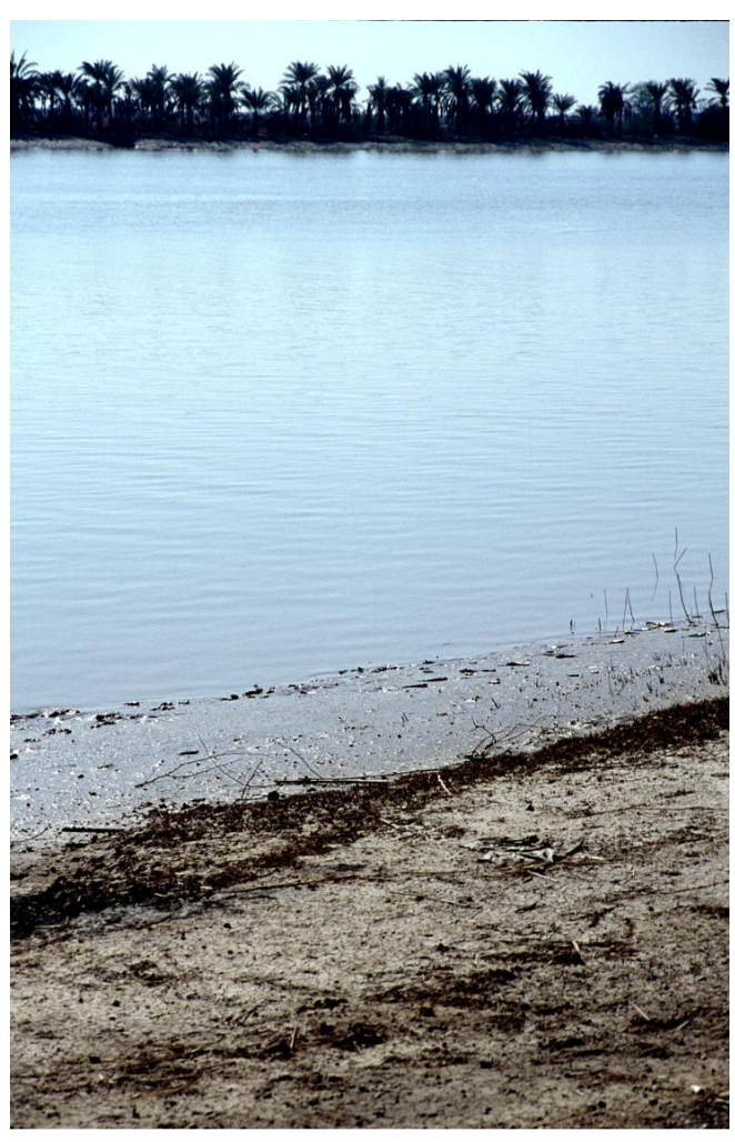
Figure 7. Habitat of Carcharhinus leucas , Khowr-e Bahmanshir at Tangeh-ye Seh, 23 November 2000, Brian W. Coad.

Baghdad about 850 km from the sea (Günther, 1874; Kennedy, 1937) before dams were built. A recent record for Iraq is documented by Hussain et al. (2012a, 20102b).