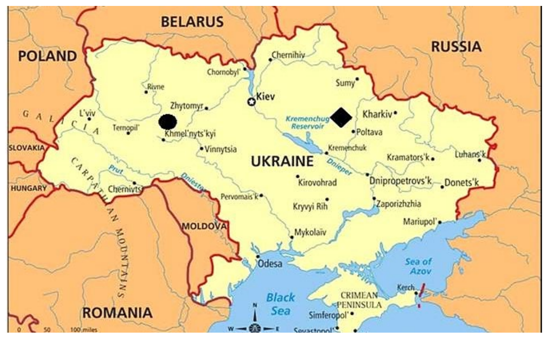
Figure 2. Map showing the type localities of Planorbarius corneus s.l. allospecies: black circle - «weastern»; black diamond - «eastern».

(50°6'27"N, 27°41'45"E) in Psel River (Fig. 2). Identification of allospecies was performed by their conchological peculiarities (Fig. 3) (Garbar, 2009).