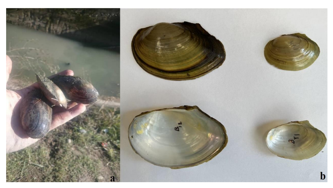
Figure 1. Anodonta anatina; a and b represent live duck mussel individuals and exterior/interior view of the mussel, respectively.