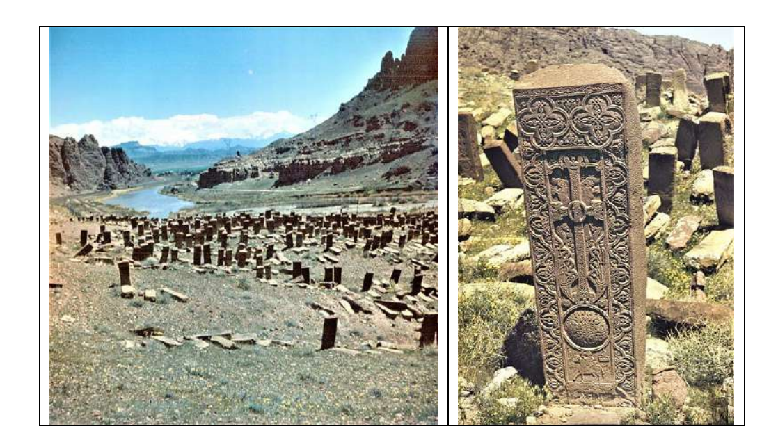
Picture 8. Armenian Medieval Gravestones in Jugha, Nakhijevan (Azerbaijan)