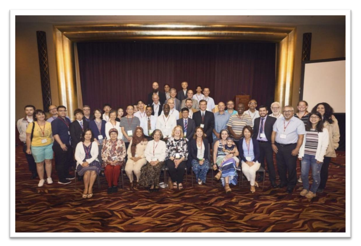
Group photo taken just before the conference broke up on the last day