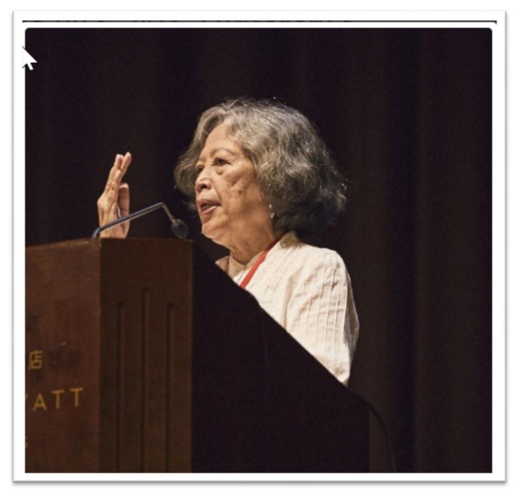
DAY 4 -- Sunday, July 15, Final conference day