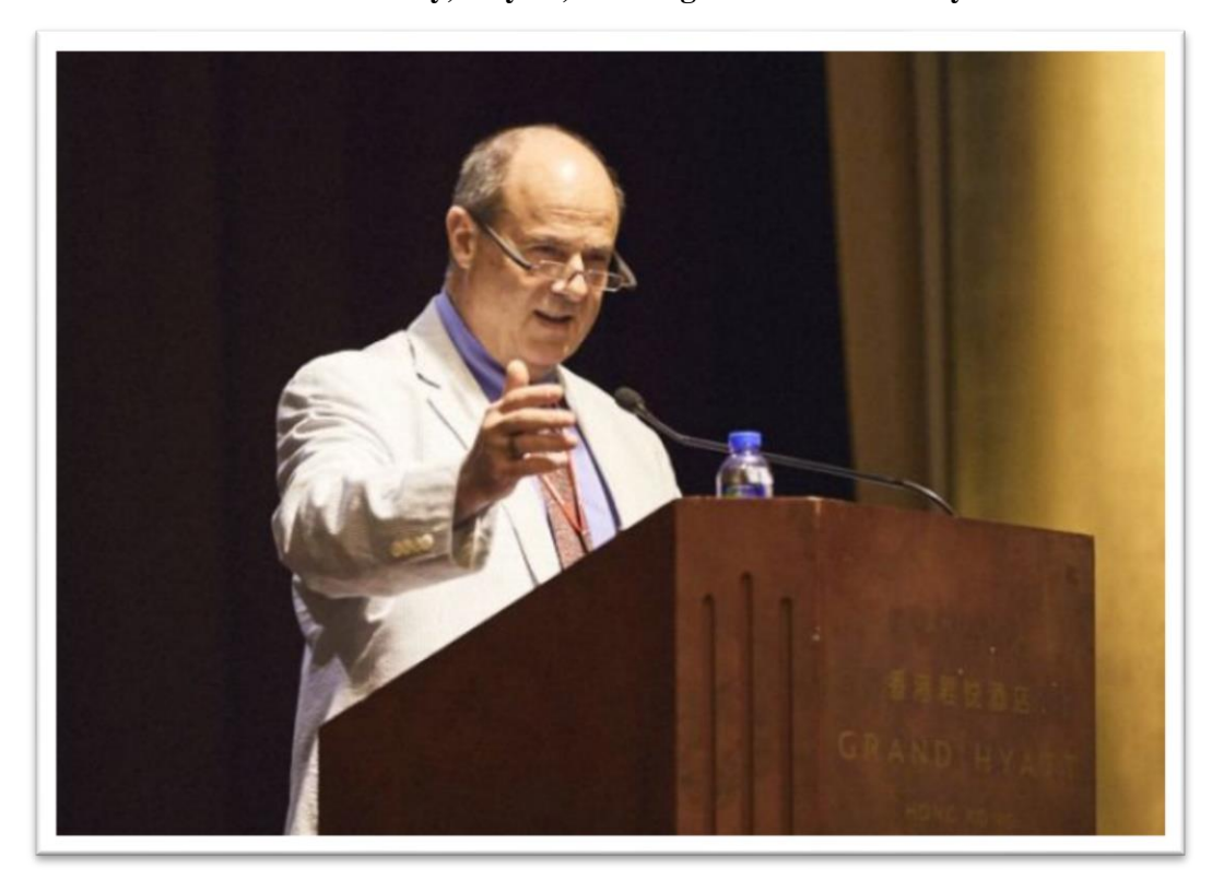
DAY 2 -- Friday, July 13, First regular conference day

The welcome reception on the opening workshop day provided a chance to relax and enjoy a beverage at the beautiful pool house of the Hyatt Hotel after a full day of attending workshops.