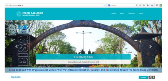
Figure 3 . Front page of e-learning Sebelas Maret University

1. Students who give answers / opinions better than the early are last. 2. Students may answer / found more than one. 3. Students are allowed to give opinions on the opinion more answer / than once. 4. Students are more answers / opinion was better than that less or no answer / opinion. 5. Lecturer gives the deadline for discussion, such as one week. Pause discussion that is too short will make it difficult for students to find material answers / responses / opinions.