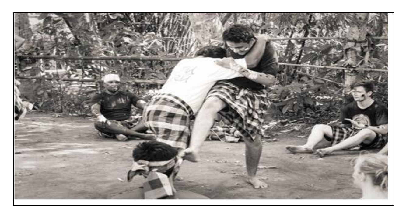
Figure 2 Bali Mepantigan Wrestling Art Performance.