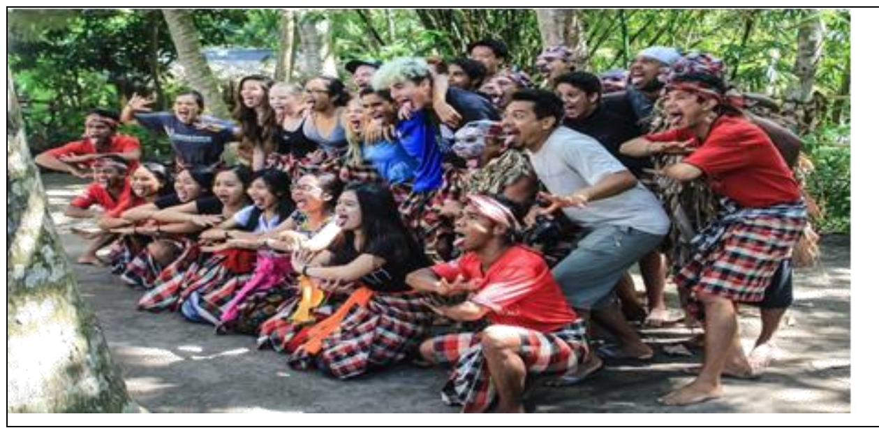
Figure 1 Bali Mepantigan Art Group.

In the1930s era, mepantigan is called Bali Ngakak which is another word of the concept of menyama braya which means mutual cooperation. In contextual term, menyama braya can be integrated with Balinese art. This art is packed interestingly and is closed with kecak dance. In those days, the followers of mepantigan were given the doctrine that the existence of mercy that was able to cultivate respect for other human beings. The ritual that took place at the time was done at night, but it evolved with a touch of innovation that now it can be done at day.