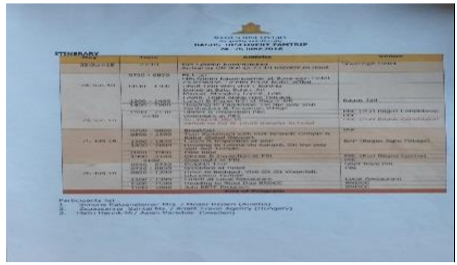
Figure 8. Itinerary Program.

After delegates been accommodated in the hotel, the following day was starting for joining tour programs conducted by Nusa Dua Bali Tours and Travel. The tour itineraries were 2 Full day tours of Karangasem East Bali and Kintamani volcano for the first program and secondly was Bedugul Tanah Lot tour before the delegates leaded to BNDCC as the BBTF venue.