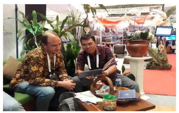
Figure 6. The seller is explaining tourism-industry products to a buyer (Photo: Ginaya, 2018).

In addition, Bagus Discovery also operates Nusa Dua Bali Tours and travel with various tour products including organizing events which is commonly termed as MICE. The example of handling an even which was also done by the author was Familiarization Trip (Famtrip) on behalf of BTTF. The process of handling was starting from welcoming the client at the airport for a transfer in, conducting tours until took them to the venue of the event in the BNDCC. Figure 7 shows the tour guide received a guide order in the office.