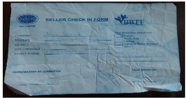
Figure 4. Seller check-in form

After having the entrance pass then the sellers could enter the venue and ready to interact with the buyers in their respective booth stand as it is shown in figure 5 and 6 below.