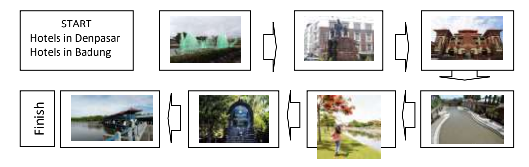
Figure 2. Badung River Package tour.

Badung River package tour starts through tourists departing by using the Go-Jek app, to Denpasar City Park, Puri Pemecutan, Pasar Badung, Kumbasari Park, Taman Pancing, Pura Luhur Tanah Kilap and the Estuary Badung Dam or the route can be random.