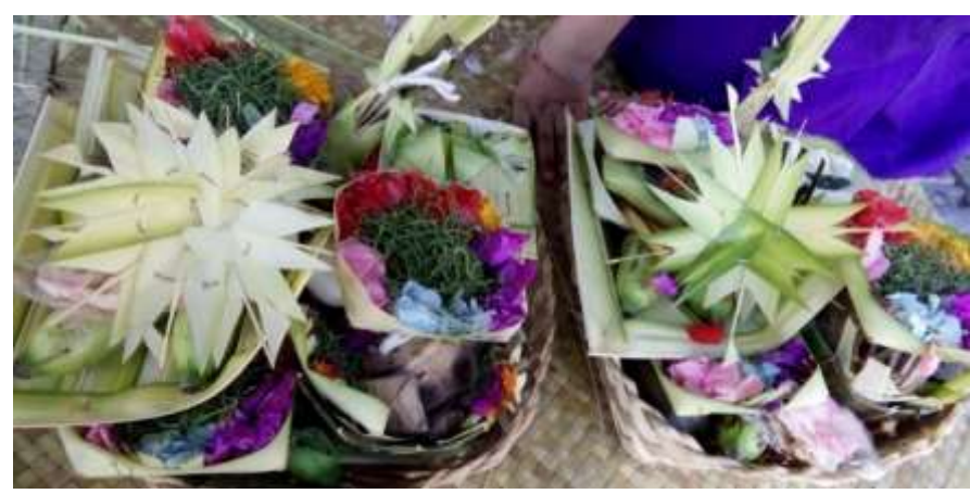
Figure 2. Banten Pejati for Okokan Art Performance

by the belief of Bali's customary social system which believes in the presence of Ida Sang Hyang Widhi in the tradition. Here is a picture of banten pejati that used to show Okokan art.