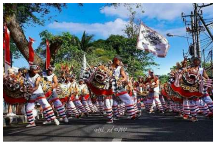
Figure 4. Two Okokan Performances

The activity in the picture above is a manifestation of Okokan art performers wearing Poleng (black and white) pants attributes during the PKB Event and Pengrupukan Day before