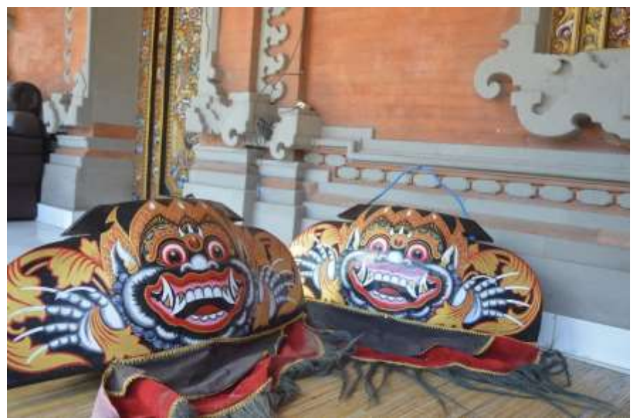
Figure 3. One of Okokan Instrument

The significance of the value of the noble value of the art of the show Okokan consists of the value of the family in the representation of folklore, the value of life safety of Ida Sang Hyang Widhi from Banten prepared, the value of work ethic in doing Dance movements, and the value of life balance between humans and nature. Okokan images used during performing arts events. Equipment used like wood Okokan , Poleng pants in Okokan show can be seen on the figure 3 and 4.