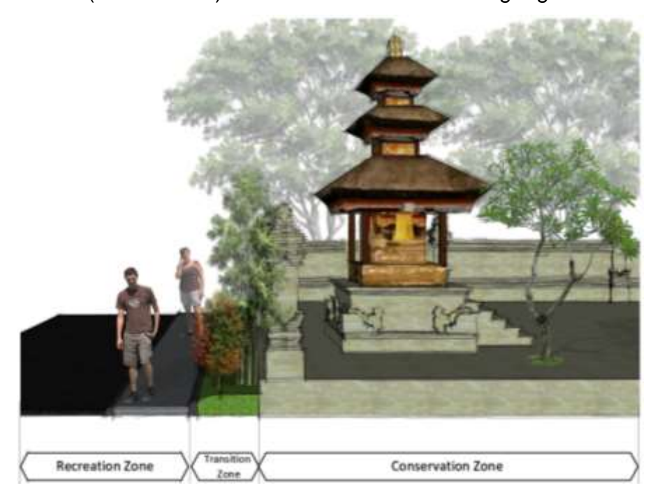
Figure 4. Transition Zone between Recreative Zone (Secular Zone) and Conservative Zone (Sacral Zone) (source: analysis result, 2018).

Zone arrangement of those temple arranged with preservation of its existence but blend in spatial on one tourist attraction. Distance between Pura Mas Beji Banyuwedang arranged with border line of a park with 1 metre width from the temple outer wall border. Kinds of plant which will be used such as mini yellow bamboo or red shoot flower. This borderline concept separating 2 zones not absolutely but separation made through harmonization in those two zones. Because of the existence of Pura Mas Beji was a part of this object. Same concept also applied in Pura Dang Kahyangan Banyuwedang. But, the borderline width is 2 metre because of these temple complex much bigger than Pura Mas Beji Banyuwedang. So, conservation of those two temples still preserved in one tourism region with it's secularity. Transition Zone between Recreative Zone (Secular Zone) and Conservative Zone (Sacral Zone) can be seen on the following Figure 4.