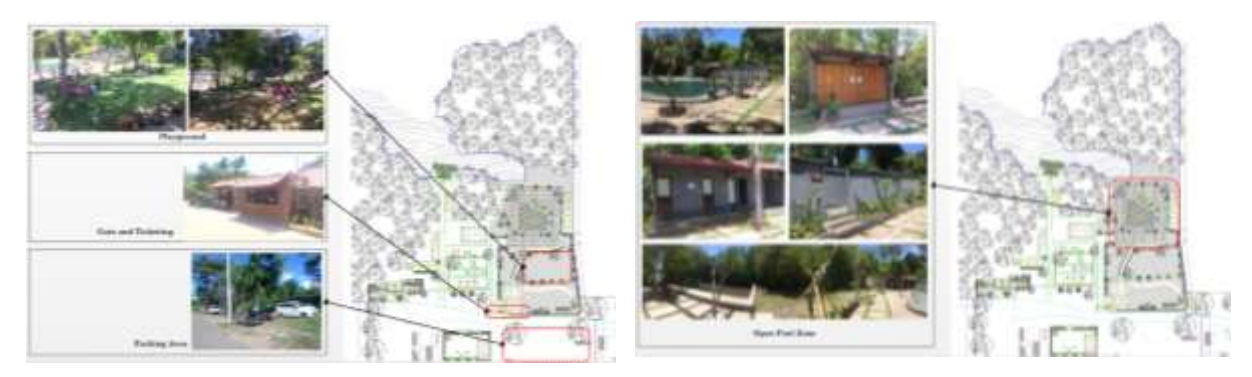
Figure 2. Banyuwedang Hot Spring Existing (source: survey result, 2018).