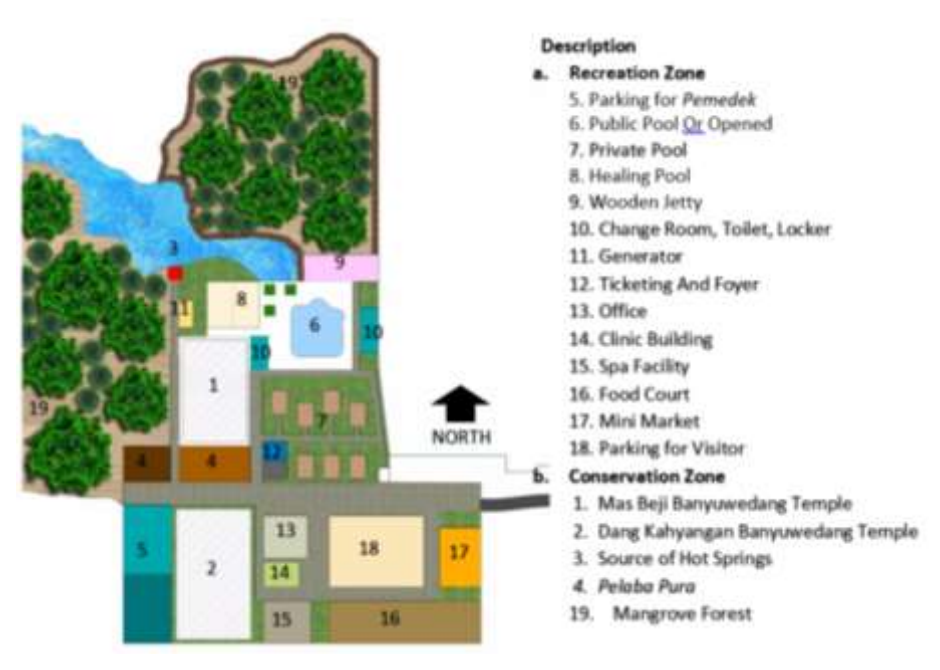
Figure 3. Block Plan of Redesigning Zone Banyuwedang Hot Springs

Block Plan of Redesigning Zone Banyuwedang Hot Springs can be seen on the following Figure 3 below: